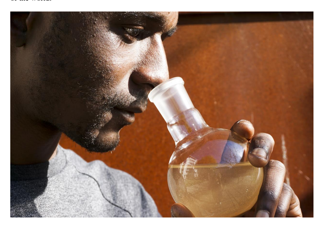
Fig 1. Becoming attentive to soil entanglements through smell. Centre Tignous d'Art Contemporain, Montreuil, France, 2019.

its aura of detachment and objectivity, the sense of sight came to dominate scientific description of the world.<sup>5</sup>