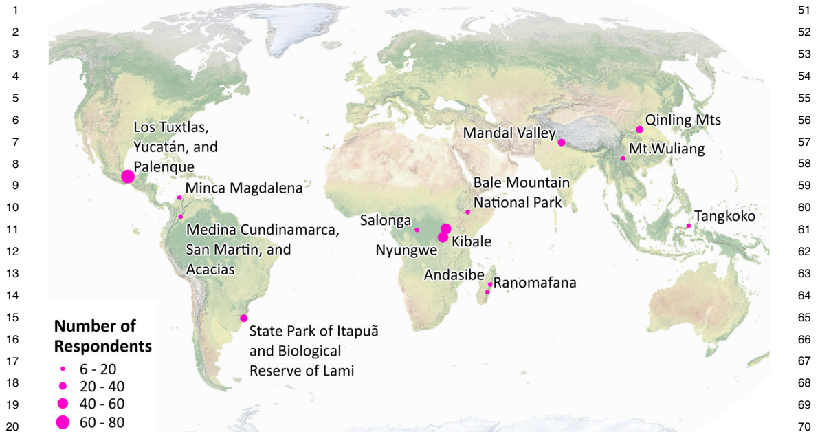
Figure 1. The location the 18 conservation sites in the 11 countries that interviews were conducted concerning social media use.

The major reason that the conservation groups gave for using social media was categorized into six classes. The most common reason (34.0%) conservation groups gave for using social media was that they wanted to announce and advertise meetings or events. The nature of the events varied from social gatherings (e.g., party to celebrate Lemur Day or the showing of a nature film), to educational talks (e.g., how to improve local health), to organizational meeting (e.g., plans to dig a trench to deter elephant crop raiding). The second most common reason (20.8%) was to educate the community. The education messages were diverse, including improved farming methods, the risk of primate diseases, proper disposal of plastic bottles, and simply conveying the wonders of nature. Conservation groups also wanted to use social media to request help from the community (18.9%), such as asking for volunteer to plant seedlings, or gathering information about aspects of community life such as the frequency of crop raiding. The fourth most frequently given major reason to use social media (13.2%) was to inform the community about planned research or to present the findings of completed