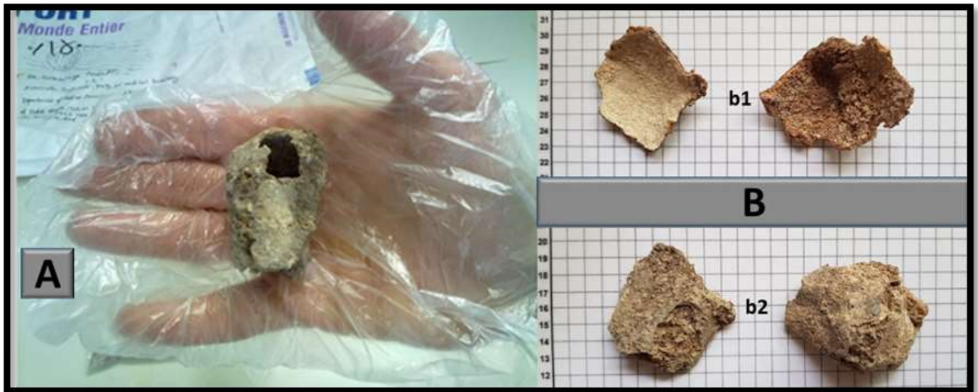
Fig. 1: The calcified object identified as hydatid cyst ( A, one of the recovered cysts, B, Represents the inner concave surface and the outer convex surface of that cyst)