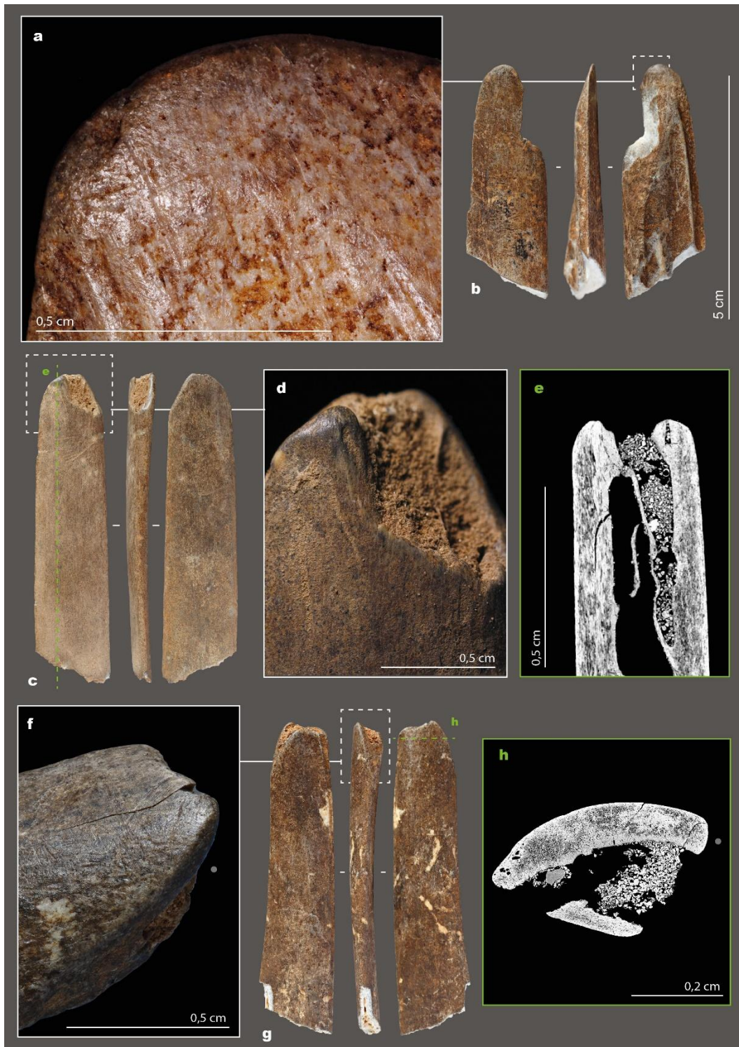
Fig. 2 Bone tools with smoothed-end from Abri Lartet. a) smoothed scar, striations and crack on the medullar side of the beveled active end; b) specimen on a metatarsal of a Rangifer tarandus ; c) specimen on a medium-sized rib of an undetermined Ungulata; d) smoothing with slight and regular striations; e) sagittal section showing smoothing on the inner and outer surfaces of the fractured end; f) facet on the lateral edge of the active end; g) specimen on a medium-sized rib of an undetermined Ungulata; h) transverse section of the lateral facet