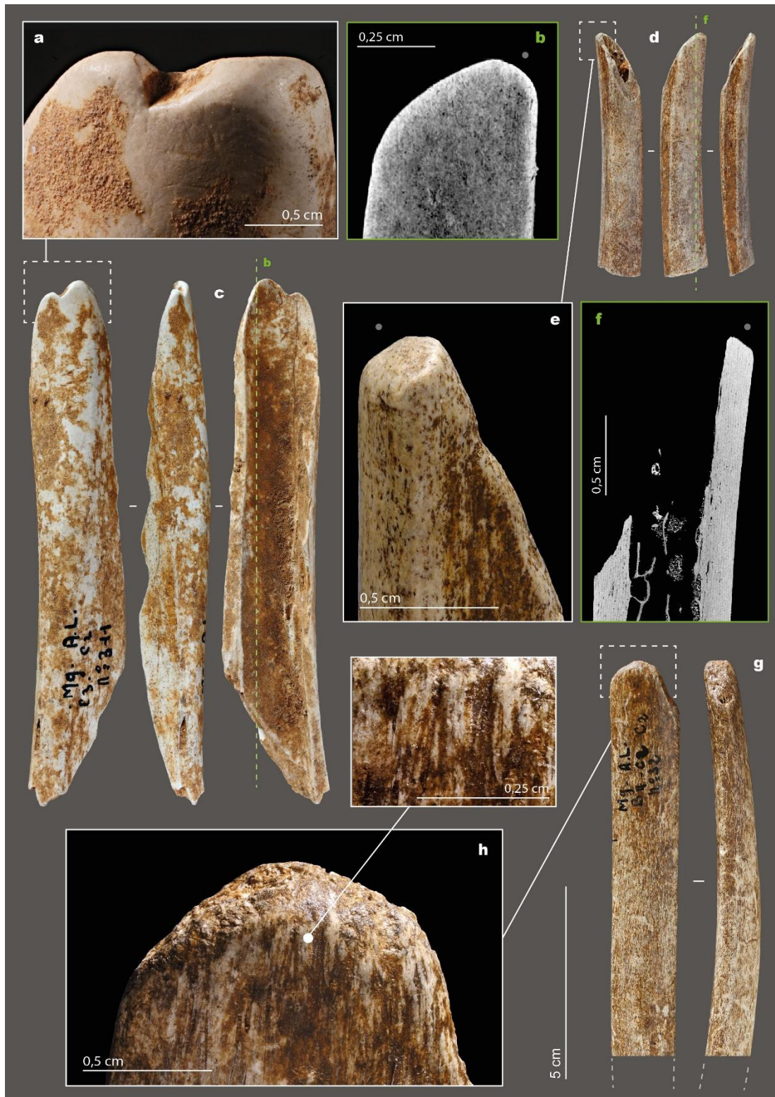
Fig. 1 Bone tools with smoothed-end from Abri Lartet. a) flexion fracture with smoothing of the active part; b) sagittal section showing invasive smoothing on the cortical side and a facet at the front edge; c) specimen on a tibia of Rangifer tarandus ; d) specimen on a medium-sized rib of an undetermined Ungulata; e) facet at the front edge; f) sagittal section showing the facet; g) specimen on a rib of Equus ferus ; h) smoothing of the active part and striations from shaping