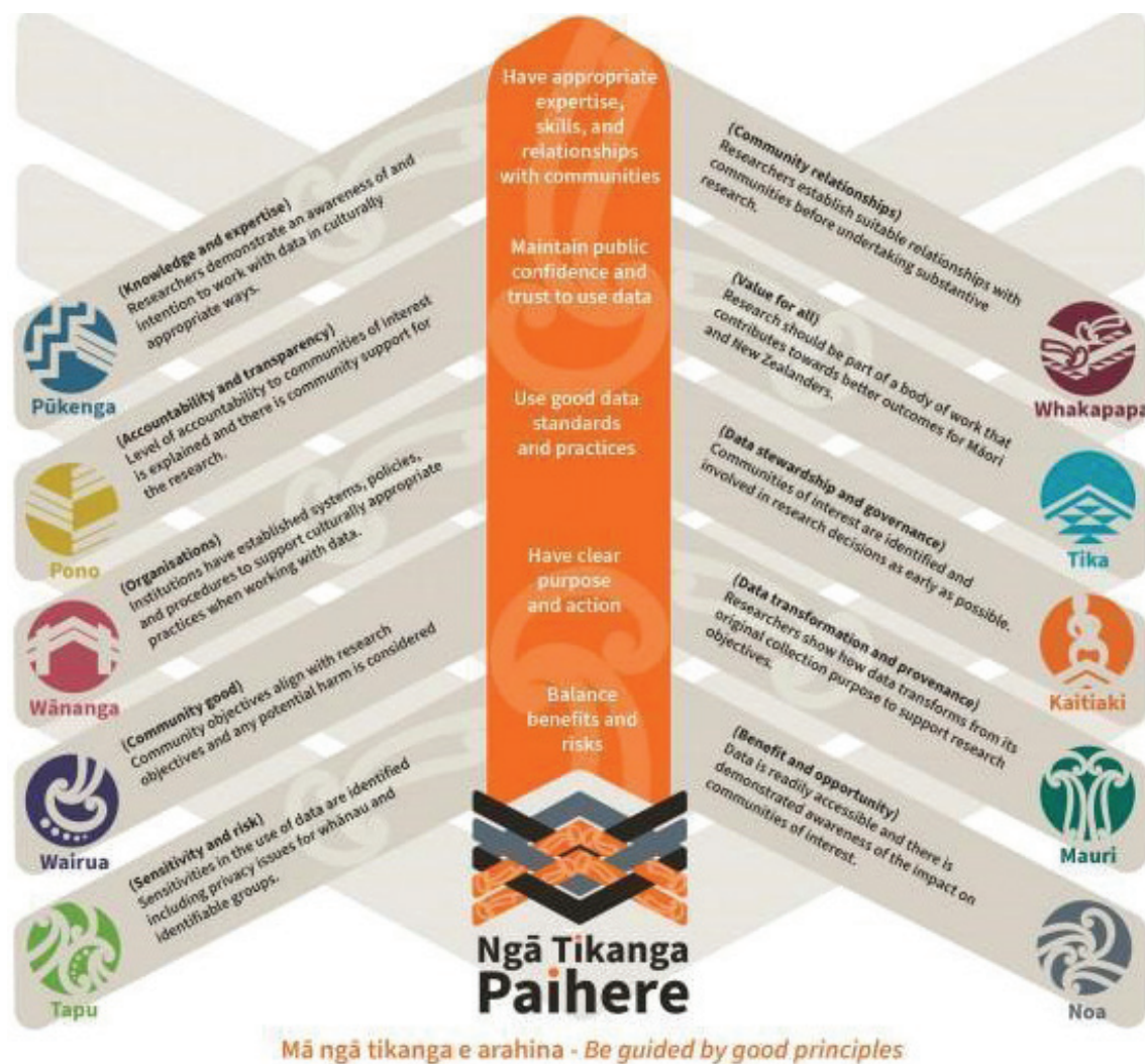
Figure 3. The Ngā Tikanga Paihere guidelines (Stats NZ, 2020, p. 10)