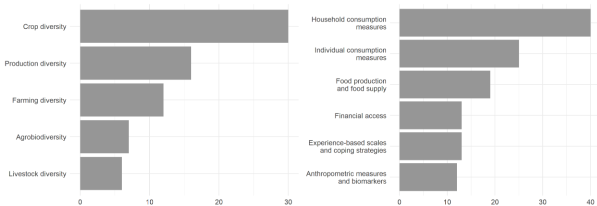
205 206 Figure 2 Number of studies using different measures of diversity (left) and different food security 207 indicators (right) used in reviewed publications (N=88). Studies that use multiple metrics are counted 208 multiple times accordingly.

191 Several indicators can be used to measure agricultural diversity, integrating different aspects of 192 diversity, richness and evenness. Richness is the number of species or agricultural products in a 193 sample. Some studies express this by comparing characteristics of cropping systems with different 194 numbers of crops cultivated or creating a binary variable to distinguish between adopters and non- 195 adopters of diversification (Birtal et al., 2015; Boedecker et al., 2014). Measures of evenness 196 consider relative dominance or concentration of species or products in the sample by measuring also 197 the abundance of each species (Whittaker, 1972). Examples of measures of evenness are the 198 Simpson diversity index (SDI) and the Shannon diversity index (H’). They differ slightly by expressing 199 dominance of the first few species in the sample (Simpson index) or relative evenness across the 200 whole sample (Shannon diversity index) (Whittaker, 1972). Abundance can be measured as area 201 used for each species, weight of produce, nutrient or energy content of each product or monetary 202 value of products. Using area can be challenging when including livestock (Sibhatu and Qaim, 203 2018a), as livestock can source feed from outside the farm, graze on public land or be fed purchased 204 feed.