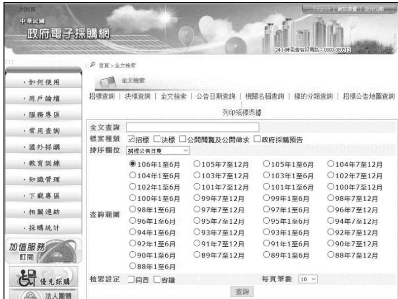
Figure 2: Example of a tender for Public Construction Commission Executive in Yuan ( http://web.pcc.gov.tw/prkms/prms-searchBulletinClient.do?root=tps )