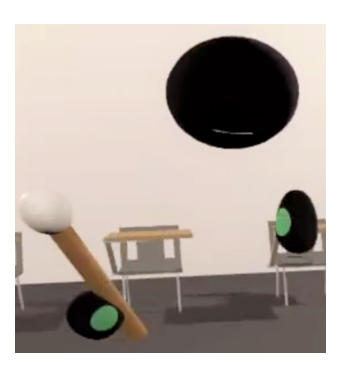
Figure 2. The default Normcore avatar used to represent the users in the VE.

using a highly realistic-looking avatar, especially regarding the use of realistic facial expressions [25]. Yet, others find that the individual can struggle when too many stimuli are present, i.e., to recognize and distinguish facial expressions from one another [26]. Moreover, when asked about the avatar design, the therapists were concerned about using a realistic avatar, being potentially intimidating. Because of the conflicting views and with the feedback from the therapists, we decided to utilise the default Normcore avatar, which is a simple iconic-looking avatar (Figure 2), to keep with our user-centered approach. The avatar had a black sphere for the head with a white, smiling mouth. The mouth changed size based on the microphone input. Remotely, the users would see other users' hands as simple mittens to reduce the amount of data needed to be sent and thus the overall latency, which also minimises the risk of cybersickness [24]. Locally, the mittens were exchanged with two five-fingered hand models, created in Autodesk Maya. This change drew upon the VRMI interaction [24] and also aimed at adding avatar-realism, to induce a higher level of perceived presence [27], and thus to increase the ecological validity of the environment that is of importance for social neuroscience.