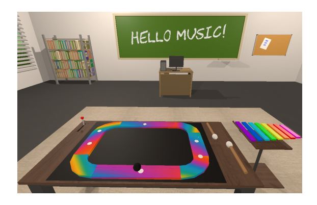
Figure 1. A view of the classroom. In the front, the play area with the two instruments, the Looper (left) and the xylophone (right).

The instruments should also be familiar while also taking advantage of VR and the ability to make elements that are otherwise not physically possible. Thus, two VR Musical Instruments (VRMIs) were created: a virtual xylophone as the familiar instrument, and The Looper as the specific VRMI (Figure 1). Their designs draw upon guidelines outlined by Serafin et al. [24]. In particular, both natural and 'magical' interaction possibilities were added, where the xylophone was promoting natural interaction and the Looper the 'magical'. Other guidelines were considered,