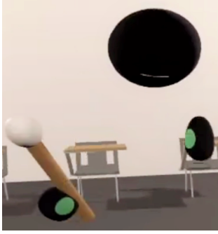
Figure 2. The default Normcore avatar used to represent the users in the VE.

using a highly realistic-looking avatar, especially regarding the use of realistic facial expressions [25]. Yet, others find that the individual can struggle when too many stimuli are present, i.e., to recognize and distinguish facial expressions from one another [26]. Moreover, when asked about the avatar design, the therapists were concerned about using a realistic avatar, being potentially intimidating. Because of the conflicting views and with the feedback from the therapists, we decided to utilise the default Normcore avatar, which is a simple iconic-looking avatar (Figure 2), to keep with our user-centered approach. The avatar had a black sphere for the head with a white, smiling mouth. The mouth changed size based on the microphone input. Remotely, the users would see other users’ hands as simple mittens to reduce the amount of data needed to be sent and thus the overall latency, which also minimises the risk of cybersickness [24]. Locally, the mittens were exchanged with two five-fingered hand models, created in Autodesk Maya. This change drew upon the VRMI interaction [24] and also aimed at adding avatar-realism, to induce a higher level of perceived presence [27], and thus to increase the ecological validity of the environment that is of importance for social neuroscience.