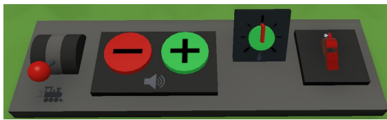
Figure 4. The control panel for the railroad system. From left to right; lever, +/- buttons, rotator, and whistle.