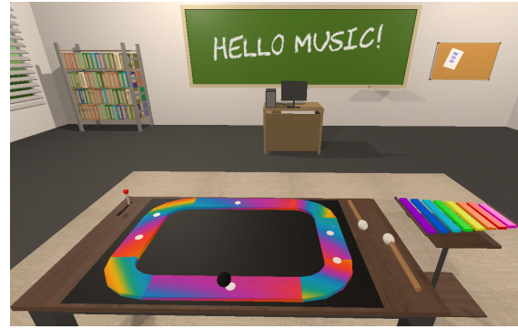
Figure 1. A view of the classroom. In the front, the play area with the two instruments, the Looper (left) and the xylophone (right).

The instruments should also be familiar while also taking advantage of VR and the ability to make elements that are otherwise not physically possible. Thus, two VR Musical Instruments (VRMIs) were created: a virtual xylophone as the familiar instrument, and The Looper as the specific VRMI (Figure 1). Their designs draw upon guidelines outlined by Serafin et al. [24]. In particular, both natural and 'magical' interaction possibilities were added, where the xylophone was promoting natural interaction and the Looper the 'magical'. Other guidelines were considered,