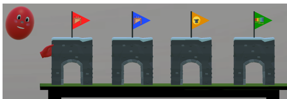
Figure 5. The flags on the gates change colours depending on the colour of the player who last interacted with it. Also, to the left; the revised avatar design in red.

possible to change the avatar colour by pressing one of the colour buttons placed on the wall. The colour allowed to better visualise what contributions each user made. When interacting with one of the gates, the flag on top of the gate changed colour corresponding to the interactor's avatar colour (Figure 5).