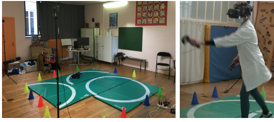
Figure 2: Left: AR setting at the day hospital - Right - a practitioner testing the application.

tioner's face inside a VR environment on a virtual television screen was deemed impossible for some children who would misunderstand the link between the image and practitioner. The total weight of the system of 563g was not considered to be a problem for autistic children aged more than 11 since it was well accepted in Newbutt et al.'s study [20]. Two HTC Vive controllers are used. Four Vive lighthouse outside-in tracking systems cover the interaction space to avoid tracking loss due to the practitioner being close to the child. Hence, trade-offs were made regarding the portability of the system in relation to its other features. The HMD runs on a desktop computer Dell Precision 3630, with i7 CPU, 32Go of RAM, and the Nvidia Geforce RTX2080. A 27-inch screen allows to monitor child's activities while being far from it.