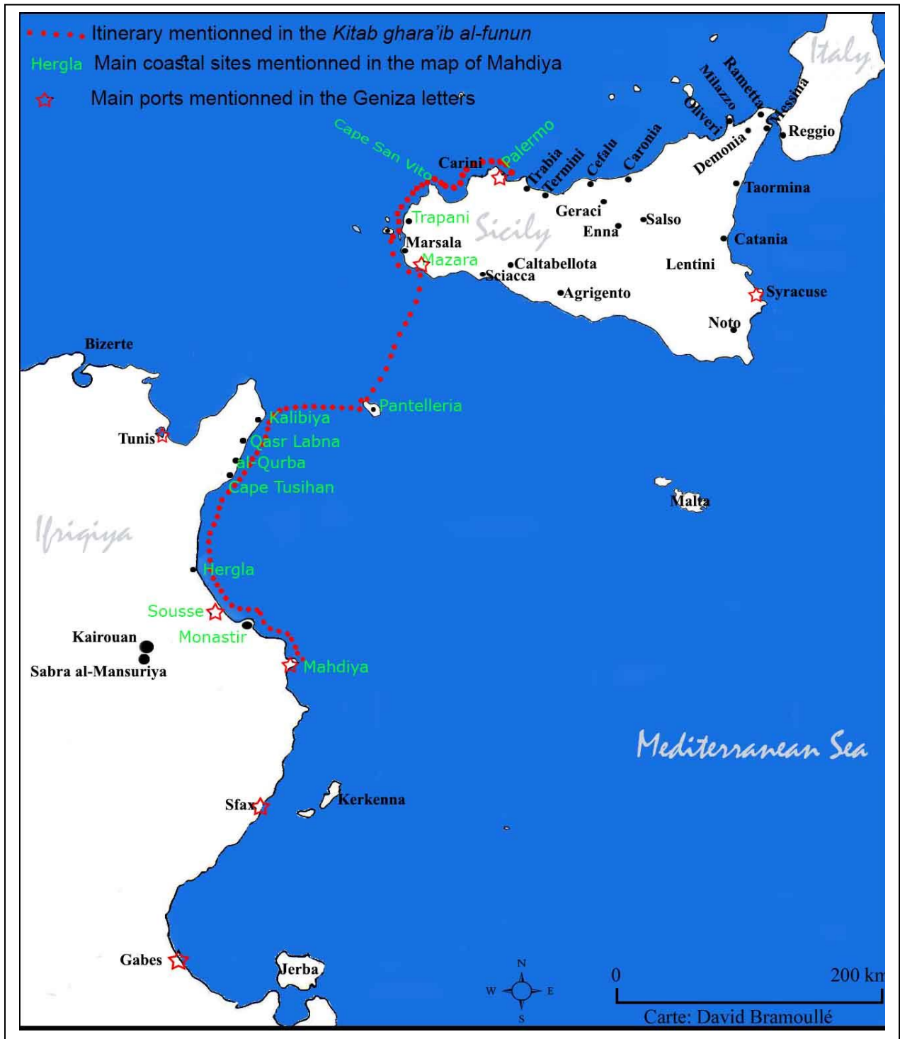
Map 6.1: Ifriqiya and Sicily during the Fatimid Era

Some Sicilian jugs, usually used for olive oil, and jars of bigger size were bought empty by the Geniza traders who were often very concerned about the leakproof quality of these