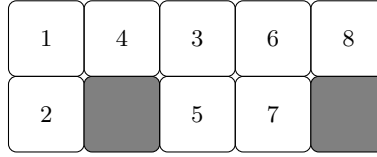
Fig. 4: An optimum schedule corresponding to the path (p_0, p_1^0, p_2^0, p_3^0, p_4^0) of Figure 3.

ones. This algorithm is composed by three main sections. Lines 1 – 6 correspond to the initialization step. Lines 7 – 9 build all the possible nodes. Lines 10 – 17 build the arcs and delete all the non connected nodes.