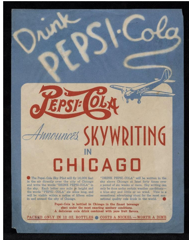
Figure 3: Pepsi-Cola Company, print advertisement, c. 1940.

popular culture. It is telling that when skywriting raised concerns in the UK in the 1920s, Savage put forth the argument before the House of Commons Committee on Skywriting that it kept the military pilots in training (British House of Commons, 1932).