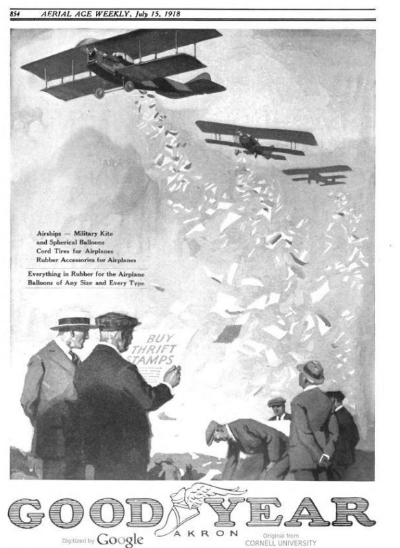
Figure 5: GoodYear, Aerial Age Weekly , 15 July 1918, p. 854

as a space of communication; and it is tied to techniques of persuasion by large corporations. We could add to these central features of the dominant view of broadcasting the association between broadcasting and spectacle, between broadcasting and military techniques, the construction of the masses as stupefied and malleable, the race for attention, the impossibility of response on the part of audiences, the physical distance between speakers and hearers, the anonymity of audiences. All those features are deployed in the barest of ways with aerial advertising.