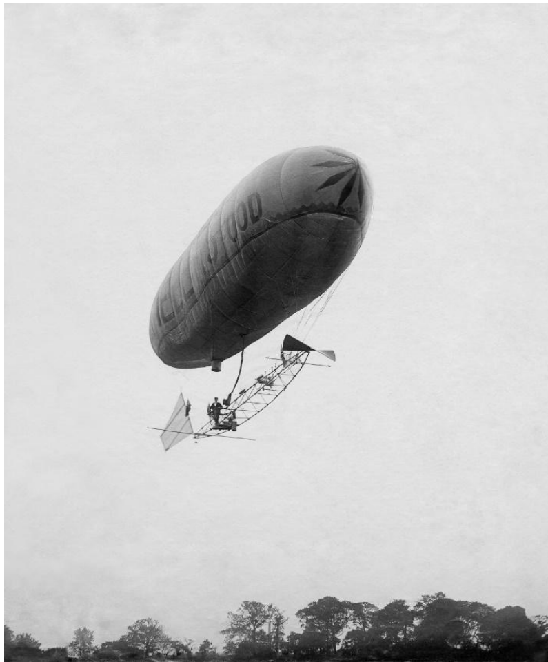
Figure 1: Mellin's Food Advertising Blimp, 1903

The fascination for the sight of machines in the sky (albeit curated and volatile) was soon exploited for communication at a distance. In the nineteenth century, merchants and inventors made use of balloons to advertise the name of a product, the location of a store, or publicize a political statement. The high visibility of the sky, and the figure/ground contrast of something seen up there, gave it a particular appeal for communication at a distance. A race to “go up” was evident in the nineteenth-century urban centers (Taylor, 2016). The surfaces of many hot-air balloons had been adorned with colorful palettes (often in a patriotic way) and painted letters. In metropolises across the world, increasingly tall buildings were themselves crowned with billboards (also often referred to as “sky-signs”), visible from the streets. Several types of balloons were a normal sight in many cities. Dreams of light projection onto the night sky were also a frequent theme in the community of electrical inventors (Marvin, 1988; Huhtamo, 2009). The early blimps—with their large fabric sides and slow pace—were