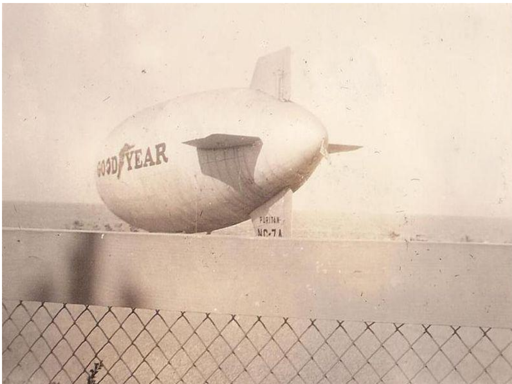
Figure 2: Goodyear Blimp, Chicago World Fair, 1933.

The marketing agencies and owners of aerial communication technologies, however, believed that the sight of a machine in the sky was sufficiently dazzling and wonderful (entertaining, perhaps?) that it would, by itself, draw both the public’s attention and adherence. And to be fair, the enthusiasm for flying machines had proven to be real. The answer was: could it last?