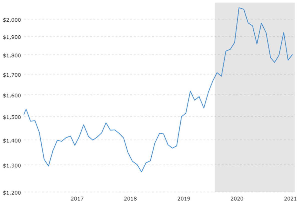
Fig. 3. Development of international gold prices, 2016–2021. (For interpretation of the references to colour in this figure legend, the reader is referred to the Web version of this article.)

continued to transport passengers to, from, and within ASGM communities.