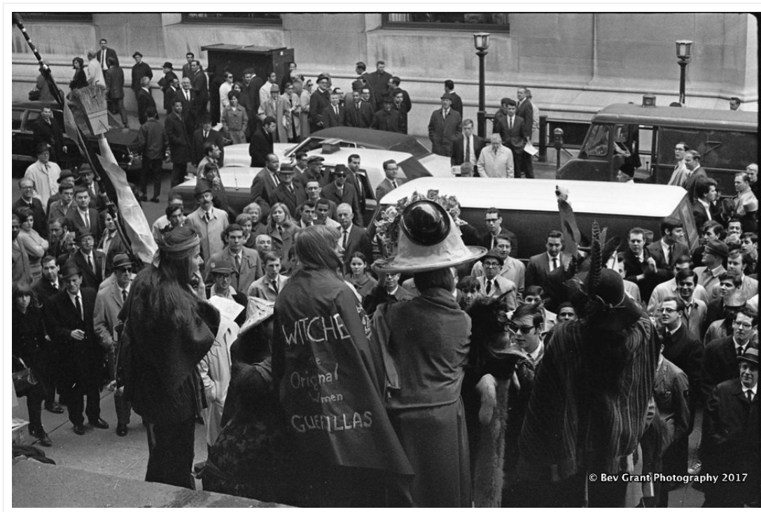
W.I.T.C.H. Hexes Wall Street, October 31 1968.