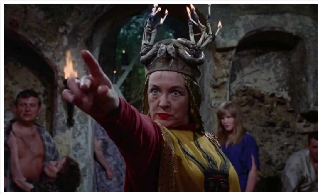
— Bax, the crone, wearing red lipstick. Screen capture from The Witches (Cyril Frankel, 1966).