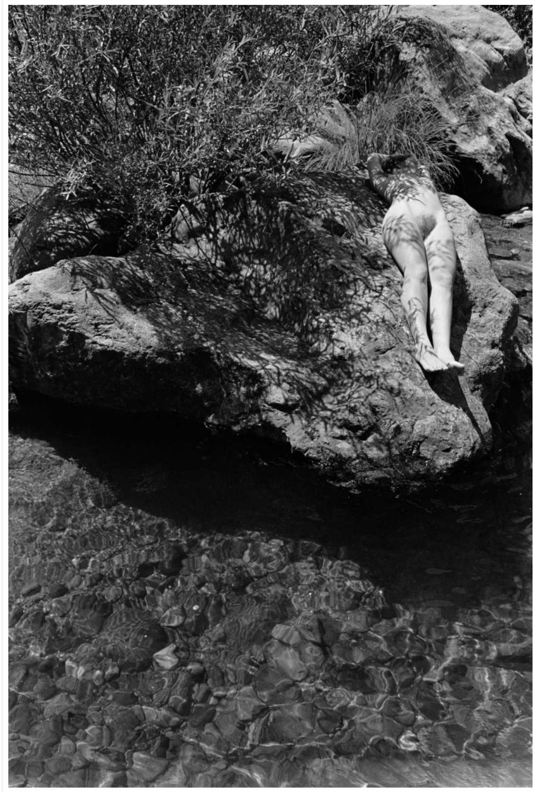
— Fig. 6. Barbara Hammer, Alone Hornby Island, British Columbia , photograph, 1972.

Against the general background of the women's movement, the rise of Goddess movements and the intersections of feminism and environmentalism, the figure of the witch was to find a new life from the late 1960s onwards. In many ways, and even if Hammer's only explicit reference to the witch appears in her 1975 film Psychosynthesis – a fast-flowing visual poem made of dissolves and superimpositions, punctuated by the cathartic laughter of a sorceress and culminating in a luscious nature sequence – the women in these early films can be seen as magical women. They are witches of a new kind, empowered women in-tune with their bodies, life, trees, the sun, water, nature. In sum,