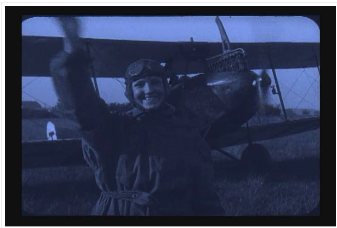
— The Aviatrix. Screen capture from Häxan ( Witchcraft through the Ages , Benjamin Christensen, 1922).

Completed one year after Ferenczi's paper, the much-celebrated Häxan by Benjamin Christensen (released in 1922) peremptorily affirms that the "witches' insanity" is "consistent with the nervous diseases we call hysteria". In his original portrayal of modern witches as (among others) wealthy and unhappy hysteric young women, Christensen, however, is rather ambiguous: by choosing to end his picture with a dissolved cross-cut between the shot of a woman forced to step into a shower by two unsympathetic nurses and the image of three witches being burned at the stake, he seems to suggest that the methods of modern psychiatry are not much different from those employed by the medieval Catholic church. Moreover, his evocation of the female pilot as modern witch – "The witch no longer flies away on her broom over rooftops" – is immensely thought-provoking. Beyond the simple flying analogy, the subversive and therefore witchy dimension of the aviatrix seems to be her arrogation of an essentially male position of power: to technically master the world, but also to see from above.