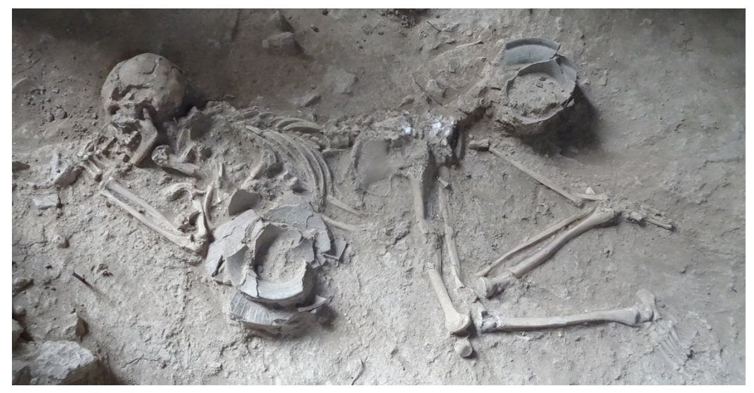
Fig 9. Burial Aa24-A26 .

Four pots were arranged along the body. Two items were arranged stacked on top of each other next to the chest at the right elbow. Two other vessels, one large and one small, were arranged behind the pelvis on the left side of the individual.