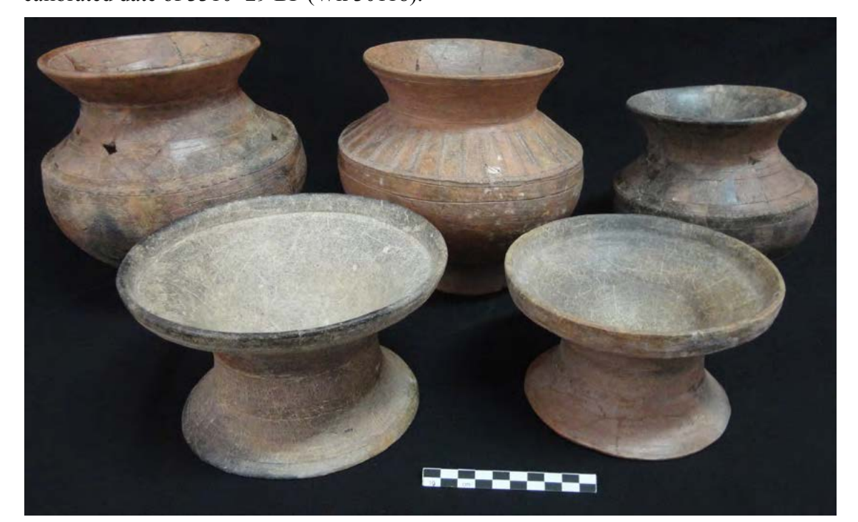
Fig. 4 Ceramic material from the burial I31 at Laang Spean's cave. Source: Sophady 2016.