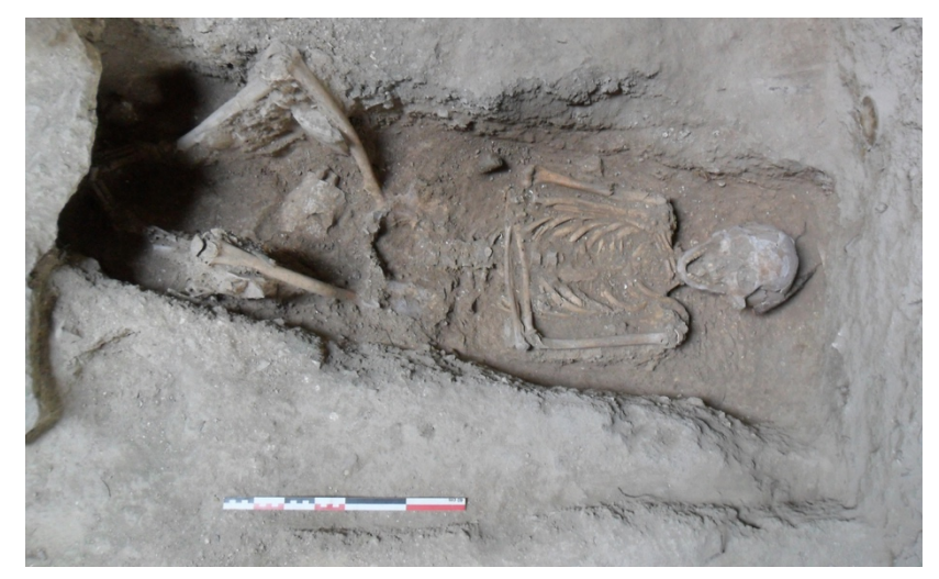
Fig 8. Burial P 31-32 .

The left lower limb is in the elongation of the body, with the knee raised and the foot pointing towards the ground, visible from its upper side. The left patella is in an anatomical position, preserved in a position of equilibrium, which implies a rapid filling of the pit. A decimetric limestone block is interposed between the lateral part of the left femur and the wall of the fossa. The right lower limb is elevated at the knee with the patella also in an anatomical position.