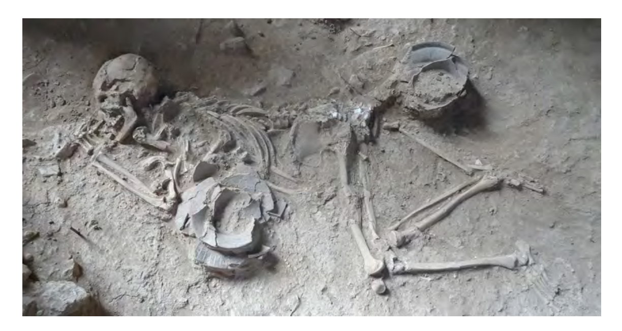
Fig. 9 Burial A24-A26.

Burial Aa24-A26 (Figure 9) is that of an adult individual whose body appears to be lying on its right side in a north-south direction, with the head to the south with her right upper limb bent and her hand under his face. The skull lay on its right side. The lower limbs were bent at an angle, with the knees and feet together.