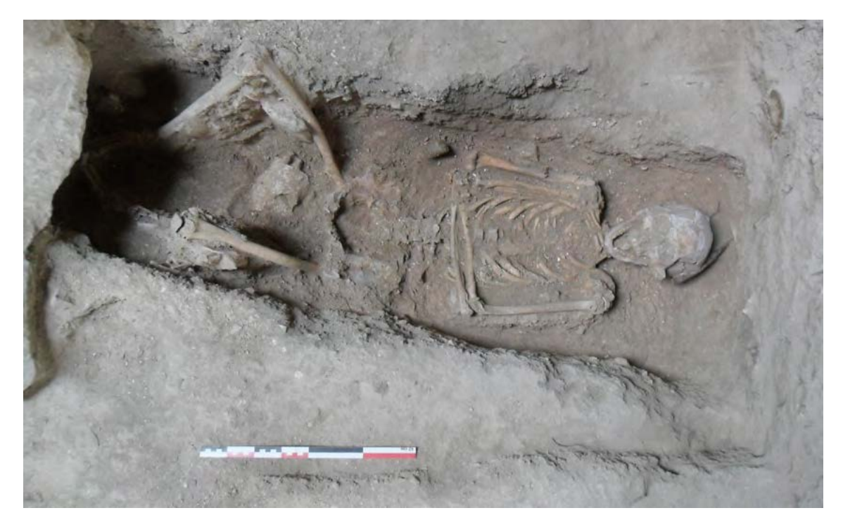
Fig. 8 Burial P 31-32.

Burial P 31-32 (Fig. 8) is that of an adult individual buried had been laid in supine position in the axis of elongation of the cavity SE-NW, the head to the SE. The individual is buried without any associated material apart from limestone blocks, some of which may have constituted wedging elements: one under the skull and two others at knee level. However, as the latter two blocks are vertical, it is also possible that they were part of the filling material of the grave without the intention of wedging the knees.