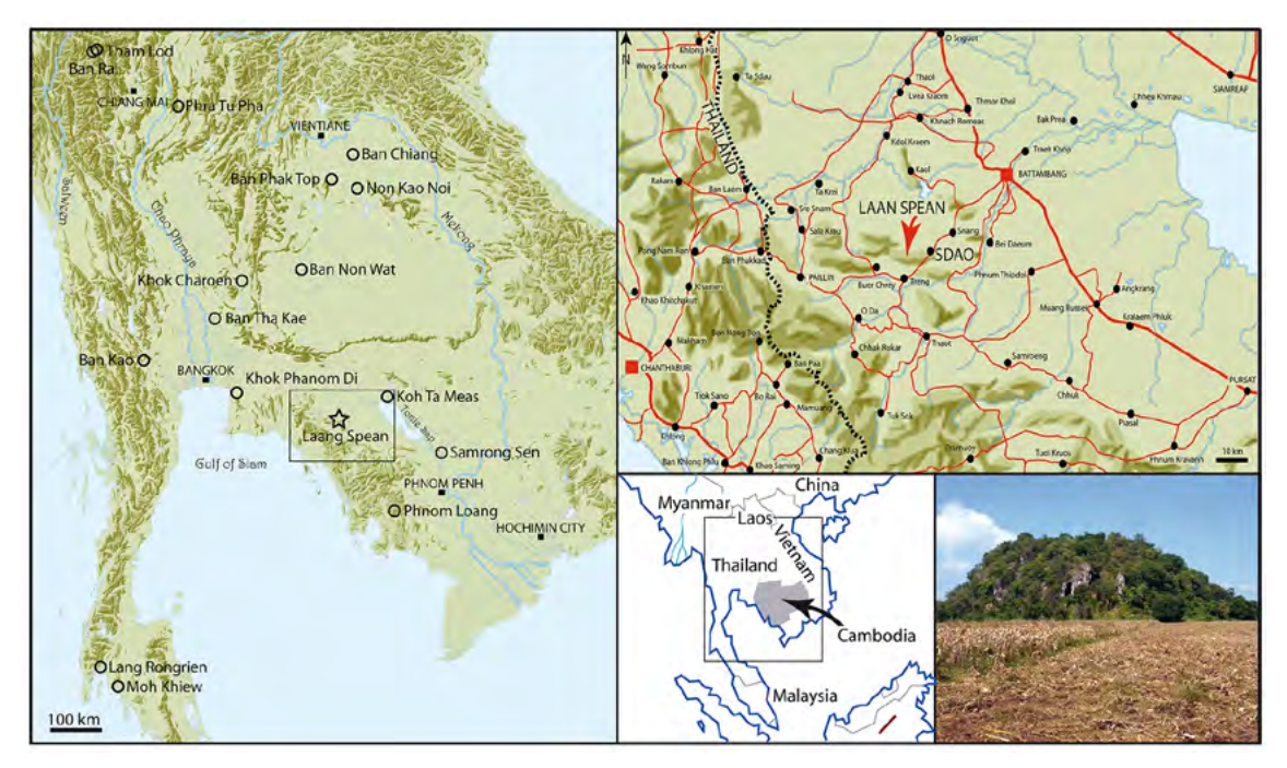
Fig. 1 Location of Laang Spean's cave.

Discovered in 1965 by Cécile and Roland Mourer the Lang Spean cave is a karstic cavity with three main chambers with a whole floor area of about 1000 m2 and a vault height of thirty meters which was excavated from 1965 to 1971 (Mourer & Mourer 1977) (Figure 1).