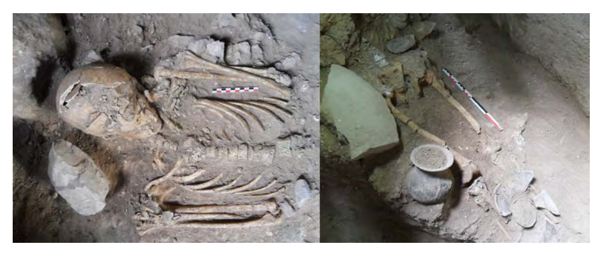
Fig. 7 Burial S32-S33.

A ring-shaped vase rested on the feet, a jar to the right of the right knee. A small jar and a complete simple adze made of hornfels are at the left elbow.