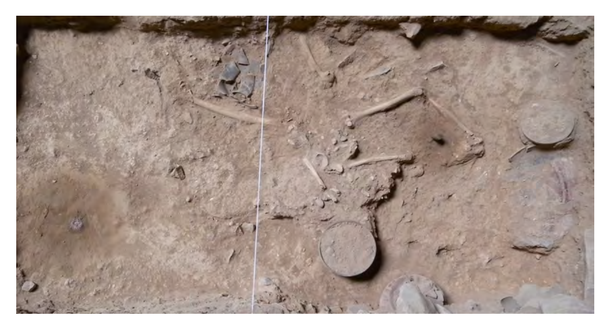
Fig. 3 Burial I31 from Laang Spean's cave.

Isolated human remains had been found during the initial excavations made by Cécile and Roland Mourer (Mourer 1994). In 2009 our research revealed new fragments of human bones, which once collected and analysed in terms of nature, ages and different apparel, showed that at least five different individuals had been interred in the second Laang Spean chamber (Sophady 2016). Moreover, in the first year of renewed excavations on the site, a first sepulture was identified. This one was relatively disturbed but, thanks to the analysis of the anatomical connections of the individual which was made directly on the field, it was possible to restore what had been the initial position of the individual buried surrounded by ceramic pots (Figure 3).