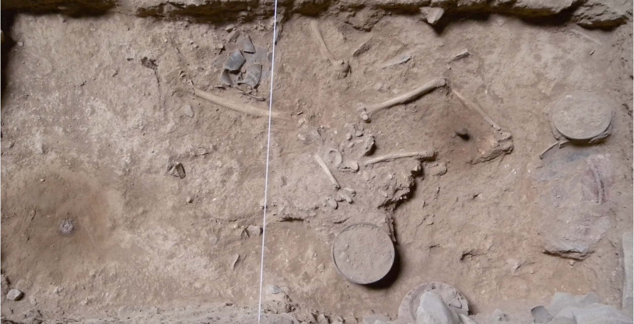
Fig 3. Burial I31 from Laang Spean 's cave.

disturbed but, thanks to the analysis of the anatomical connections of the individual which was made directly on the field, it was possible to restore what had been the initial position of the individual buried surrounded by ceramic pots (Fig 3.).