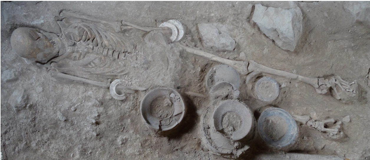
Fig 6. Burial D26-28 .

Burial D26-28 (Fig. 6) is that of an adult individual whose body had been laid in supine position along the axis of elongation of the cavity SE-NW, the head SE, the lower limbs in extension with the knees in elevation. Numerous biconical beads are distributed in a sling from the right elbow to the left of the pelvis. Five potteries were placed around the body of the deceased. Two pots have been placed between the knees. One vase is located to the right of the right knee and a ring footed pot to the outside of the right shin. Another pot is located at the top of the right femur. Two bangles were worn on the left hand and one bangle was worn on the right hand.