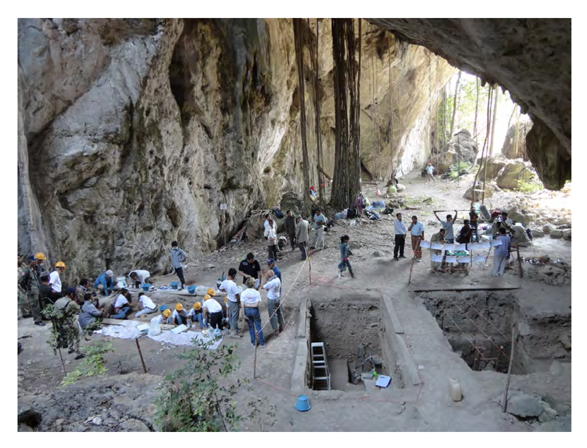
Fig. 2 Excavation of Laang Spean's cave in 2009.