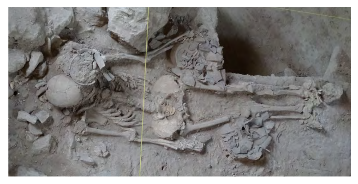
Fig. 5 Burial B27.

The individual of the burial B27-28 (Fig. 5) had been laid in supine position along the axis of the cavity SE-NW, the head to the SE, the lower limbs in extension with the knees in elevation. The individual is in association with three pots placed on either side of the body of the deceased. One pot was placed to the left of the skull, another between the wrist and the left femur, a third to the right of the right knee. Archaeothanatological analysis of all the movements of the anatomical elements during the decomposition of the body indicates that some spaces have remained empty since the initial arrangement of the tomb.