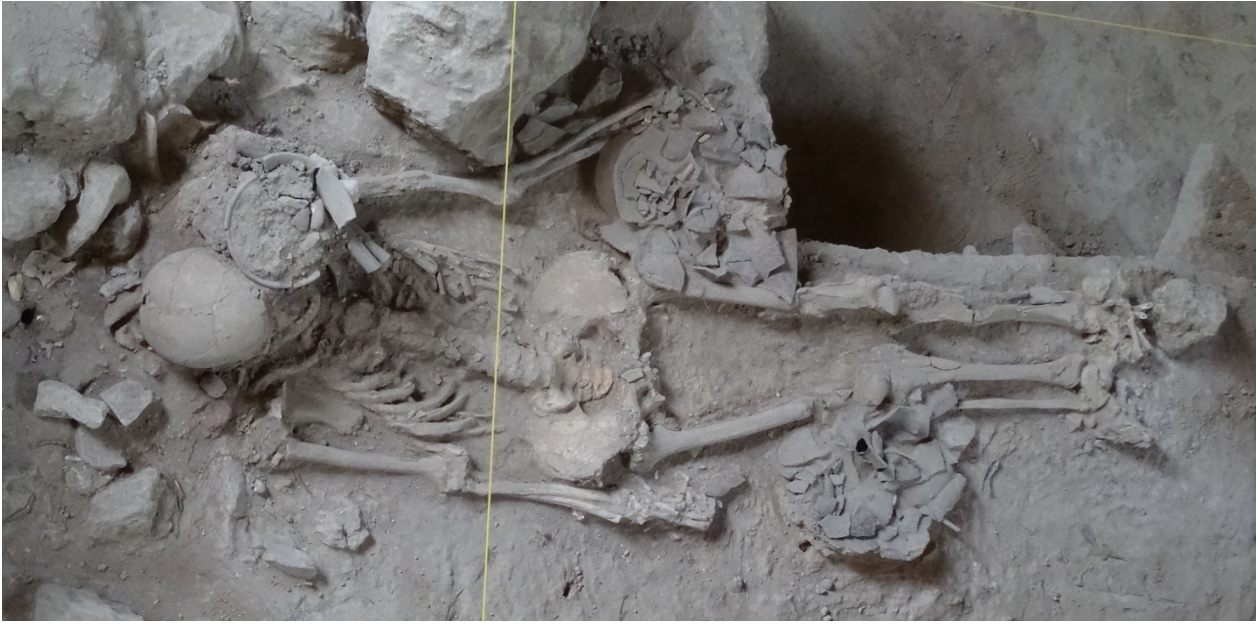
Fig 5. Burial B27 . Source: H. Forestier

Burial D26-28 (Fig. 6) is that of an adult individual whose body had been laid in supine position along the axis of elongation of the cavity SE-NW, the head SE, the lower limbs in extension with the knees in elevation. Numerous biconical beads are distributed in a sling from the right elbow to the left of the pelvis. Five potteries were placed around the body of the deceased. Two pots have been placed between the knees. One vase is located to the right of the right knee and a ring footed pot to the outside of the right shin. Another pot is located at the top of the right femur. Two bangles were worn on the left hand and one bangle was worn on the right hand.