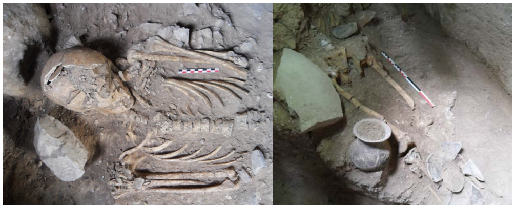
Fig 7. Burial S32-S33 . Source: H. Forestier

A ring-shaped vase rested on the feet, a jar to the right of the right knee. A small jar and a complete simple adze made of hornfels are at the left elbow.