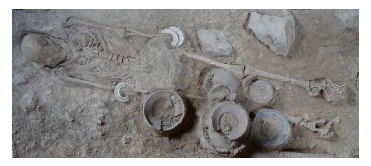
Fig. 6 Burial D26-28.

Burial S32-S33 (Fig. 7) is the grave of an adult individual who had been laid in supine position in a north-south direction, with his head to the north. The lower limbs are extended while the upper limbs are bent, the hands at shoulder level. The burial is located in a natural alcove in the cave wall and a metric block of limestone limits the burial to the north.