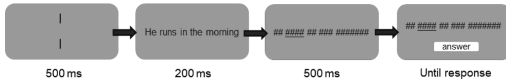
Figure 1 Procedure of One Trial in Experiment 1 With an Example of a Grammatically Correct Word Sequence Presented in Lowercase and With the Target Word (“Runs”) in Position 2