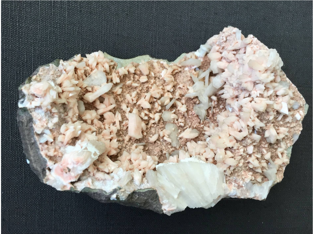
A natural sample of heulandite and stilbite zeolites (20 cm in its largest dimension). Personal collection of the author.

Zeolites can be considered as a network of molecular-size cavities. They are made by an assembly of silicon and oxygen tetrahedra. Cavities formed in these atomic scaffoldings can range from a few angstroms to 1 or 2 nanometers. These are the exact dimensions for small molecules like water (3 Å). Water, when trapped in a zeolite with the appropriate size, will escape during heating, with the stone itself seemingly boiling.