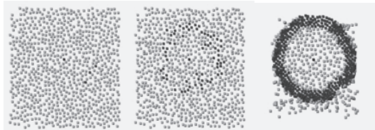
Figure 1: Sequences of direct self-organization of mobile robots into a circle

Another example relates to the formation of regular spatial patterns in mobile particles [17]. Given a number of particles distributed in an environment, it is possible to devise distributed algorithms that, by locally driving the movements of the particles, eventually lead the system to self-organize in globally regular shapes. For instance (Figure 1): a simple leader election algorithm can determine the center of gravity of the particles; then, the center of gravity can propagate in the network with a sort of “gravitational field” attracting all other particles toward the center, ending in a circular organization of particles.