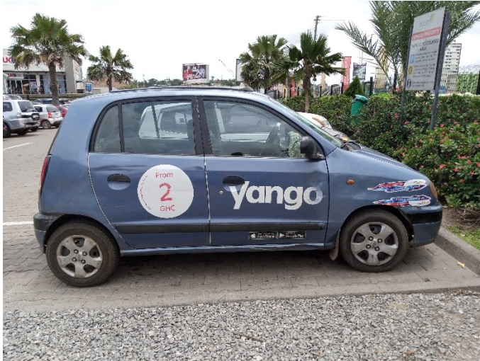
Figure 5. A typical e-hailing car.

Another key local adaptation of Uber's business model had to do with vehicle ownership. As one interviewee remarked "In Europe people can get loans to buy Mercedes and other nice cars (...) to drive for Uber. This is not possible here. Here you have people who have the money to buy cars but do not have time to drive them with Uber, and people who have the time to drive but do not have a car" 22 . This observation was fully metabolized by Uber's operations team, which worked to identify and connect car leasing companies and wealthy individuals with potential drivers. In fact, this practice was already common in the transportation industry, where leases and work-and-pay arrangements with car owners were a common entry point for drivers to get a car or trotro 23 . Uber combined this with an intensive recruitment campaign among potential drivers, and incentives in the form of hourly pay for drivers, so they could be available for customers 24 . Finally, a wide marketing campaign on social media such as Facebook was conducted to let potential customers know about Uber.