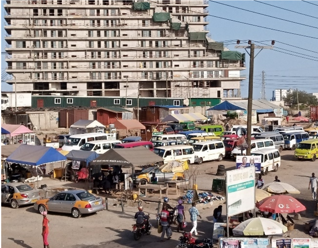
Figure 1: The Shiashi-East Legon trotro and taxi station, Accra. The picture shows a trotro and taxi station in Accra, the taxi terminal being indicated by the blue and grey tents.

In spite of the apparent informality of trotro, the transportation sector in Ghana is highly regulated due to its unionised structure. The Ghana Private Road Transport Union (GPRTU) covers approximately 70% of all trotro, taxi drivers and vehicle owners in the country, with the remaining 30% operating under the Progressive Transport Owners Association (PROTOA) and Ghana Co-operative Transport Association 13 . These unions act as business operating entities that bring together vehicle owners, drivers and owner-drivers. Members of a GPRTU branch typically operate on an established set of routes from a specific terminal 14 . GPRTU is traditionally omnipresent in the regulation of the transport industry in Ghana, and sits every quarter with the government to revise taxis and trotro ticket fares (based on factors such as inflation, increases in the price of spare parts and fuel). GPRTU is so influential in the transport sector that it is practically in charge of identifying new routes areas and stations across the country, and naming new stop locations. GPRTU and PROTOA have been vocally opposed to e-hailing platforms and have denounced the unfair competition they created for taxi drivers on many occasions. However, this has never led to street fights between Uber and taxi drivers as in other cities.