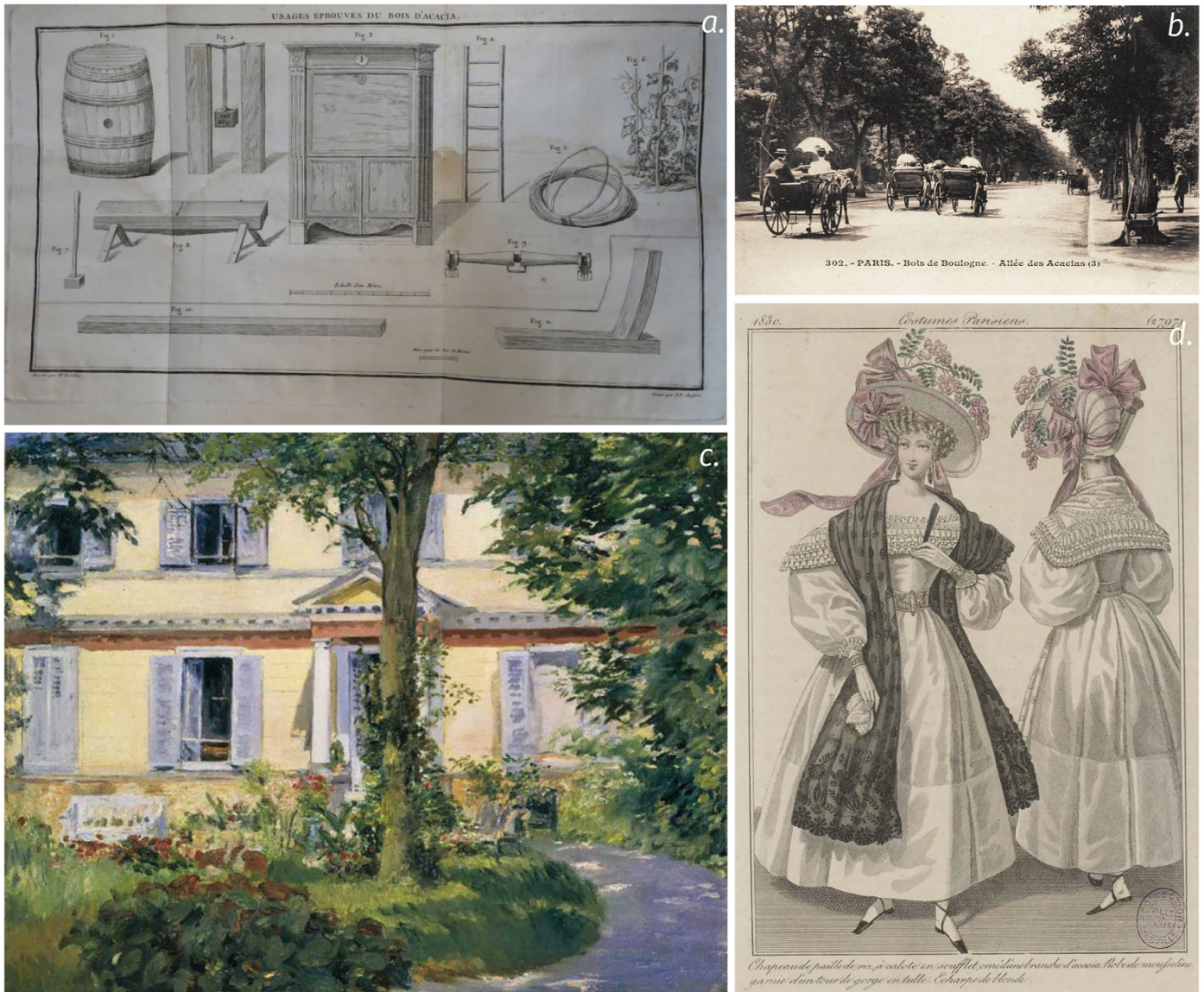
Fig. 2. Robinia uses in the nineteenth century: a. 'Proven uses of Acacia wood' in Juglar l'Ainé, Le triomphe de l'Acacia , Paris, 1808. b. The 'alley of acacias' in the Boulogne woodland (Paris, sixteenth arrondissement) c. Édouard Manet. La Maison de Rueil , 1882 (Alte National-Galerie, Berlin). d. 'Parisian costumes: Hat made of rice straw, with a gusseted cap, decorated with an acacia branch' (Anonymous, 1830, Palais Galliera, musée de la Mode de la Ville de Paris, G.16184).

Ultimately, if Black locust was fully integrated into the ambitions of foresters, agriculture and especially viticulture were crucial in its institutionalization as a peasant species in many regions. Daily and agricultural uses ensured a significant role in the rural economy: fuelwood, fences posts, honey production, cattle fodder, toy manufacturing... Multiple outlets meant possible off-season earnings for farmers with 'acacia' plots. Some sources came to assume the groves of the handy species as an integral part of the local 'terroir'. 56 It was notably the case in winemaking regions, where the