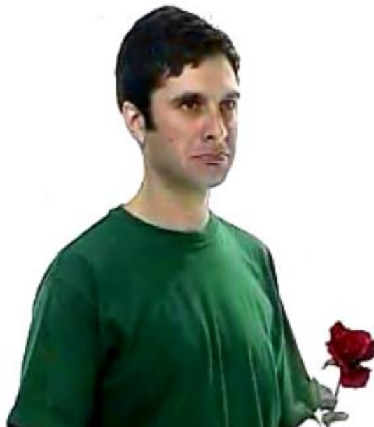
2. The man is visibly sad after the woman rejects his gift.