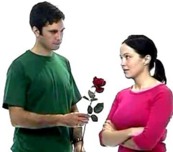
1. The man offers the flower to the woman.