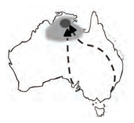
Figure 2: The routes of expansion of the original pidgin(s).

The Australian language Kriol resulted from the creolization of a pidgin commonly referred to as the Northern Territory Pidgin, which came to be used in the Northern Territory in the second half of the 19th century (Koch 2000; Troy 1994). As shown in Figure 2, the pidgin(s) originated in the south of the continent (where colonization started) and then progressed northwards along at least two paths. This slow progression resulted in influence from distant languages from the south of the continent (Simpson 2000; Mühlhäusler 2008; Meakins 2014), which presumably combined, at a later stage, with more local influences by Australian languages spoken in each particular Kriol regional variety (Munro 2004).