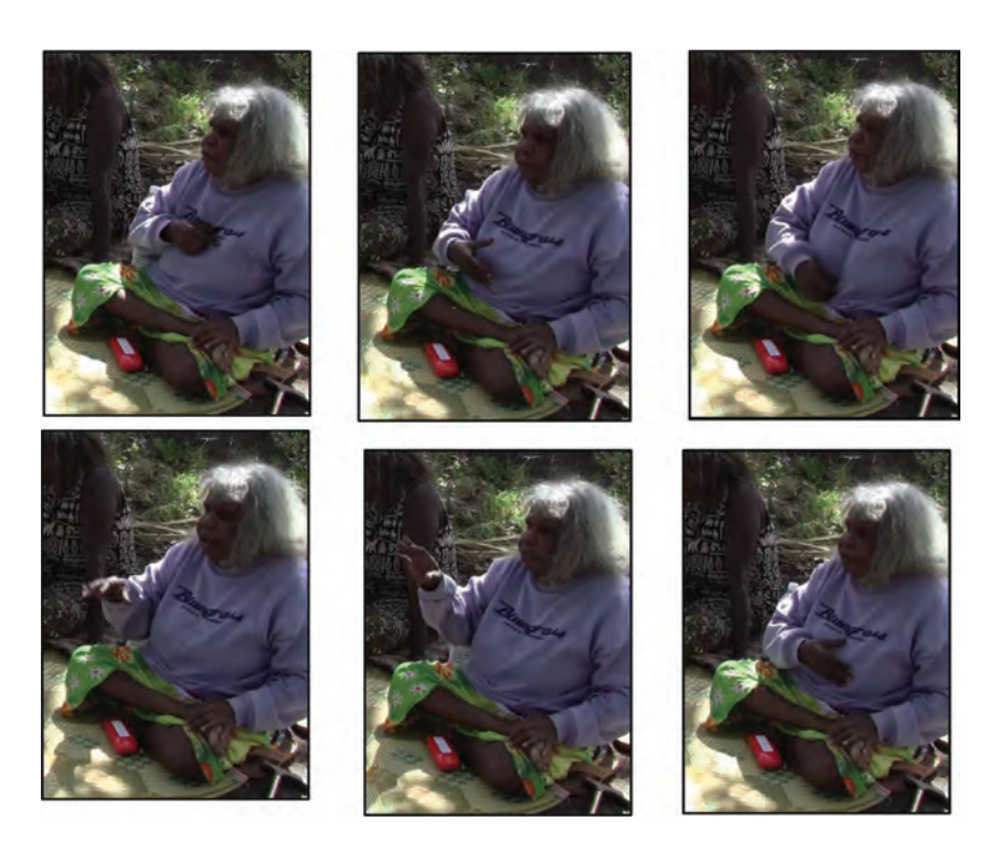
Figure 7: First row: a, b, c; second row: d, e, f. As she mentions God, the speaker puts her hand on her heart (a), pointing to her heart with her index finger. When explaining that the character of the story will feel better (kangu-yurd(mu)) , she moves her hand down from her heart to her navel (b, c) and lower, and then away from her belly and up in a swift gesture (d), and finally lifts her open hand up again, facing outside (e). Unfortunately, the movement is so fast that it is hard to capture in still pictures. In (f), the speaker brings her hand back to her belly and produces a second metaphor (see below).

In spite of very different realizations, there are important resemblances between the Dalabon gestures in (20) and the Kriol gestures in (18). Both sequences represent something going through the belly, and therefore they both instantiate the same metaphor: EMOTIONAL RELIEF IS LIKE SOMETHING GOING THROUGH THE ABDOMEN/BELLY. In Dalabon, this metaphor accompanies a conventional verbal metaphor encapsulated in the lexicalized verbal compound kangu-yurd(mu) 'belly'+'run/flow', 'feel good'. In Kriol, on the other hand, the metaphorical gesture does not accompany a verbal metaphor: it is the sole expression of a metaphor that is not attested as a verbal metaphor anywhere else in my corpus. This suggests that Kriol speakers' gestures can reflect Dalabon (or Australian) metaphors, even when these are not reflected in Kriol speech.