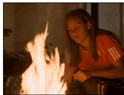
Fig. 5 Delilah watching her fire in the night