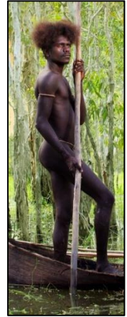
Fig. 3 Dayindi/Yerarlpaaril in the movie Ten Canoes

‘The women have seen the little young man who’s over there.’