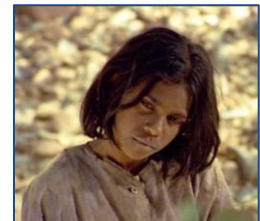
Fig. 4 Molly in Rabbit-Proof Fence

‘Mmm a smart little girl... Little young girl.’