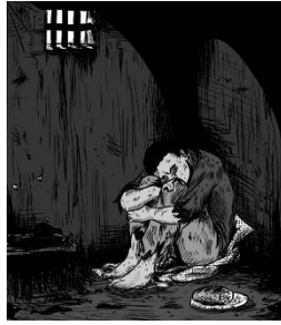
Figure 5. Picture from the in elicitation.