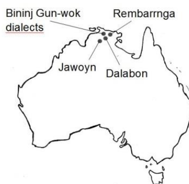
Figure 3. Australian languages of the Barunga Region.

Prior to colonization, at least four languages were spoken in the Barunga region: Bininj Gun-wok (dialect chain, Evans 2003); Dalabon (Evans & Merlan 2003; Evans, Brown & Corbett 2001; Evans, Merlan & Tukumba 2004; Cutfield 2011; Ponsonnet 2014a); Jawoyn (Merlan & Jacq 2005); and Rembarrnga (McKay 1975; Saulwick 2003a; Saulwick 2003b) (Fig. 3). All of these are head-marking, highly polysynthetic languages of the Gunwinyguan family (non-Pama-Nyungan). These languages are potential local substrates for the Barunga creole variety.