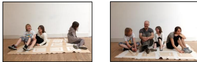
Figure 1a and 1b. Pictures used in elicitation.

‘And you, you are bending down, you two might have been arguing and that’s why you are sad.’