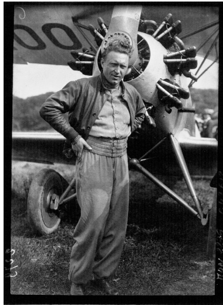
Fig. 4. Gerhard Fieseler

Bibliothèque nationale de France, Mondial, 2279, The German Fieseler, 4 June 1932, http://catalogue.bnf.fr/ark:/12148/cb41599162b .