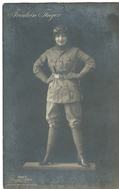
Fig. 3. German Postcard "Fräulein Flieger"

Personal collection of the author, Postkartenvertrieb Willi Sanke, "Fräulein Flieger", 5000/3, Berlin, ca.1918.