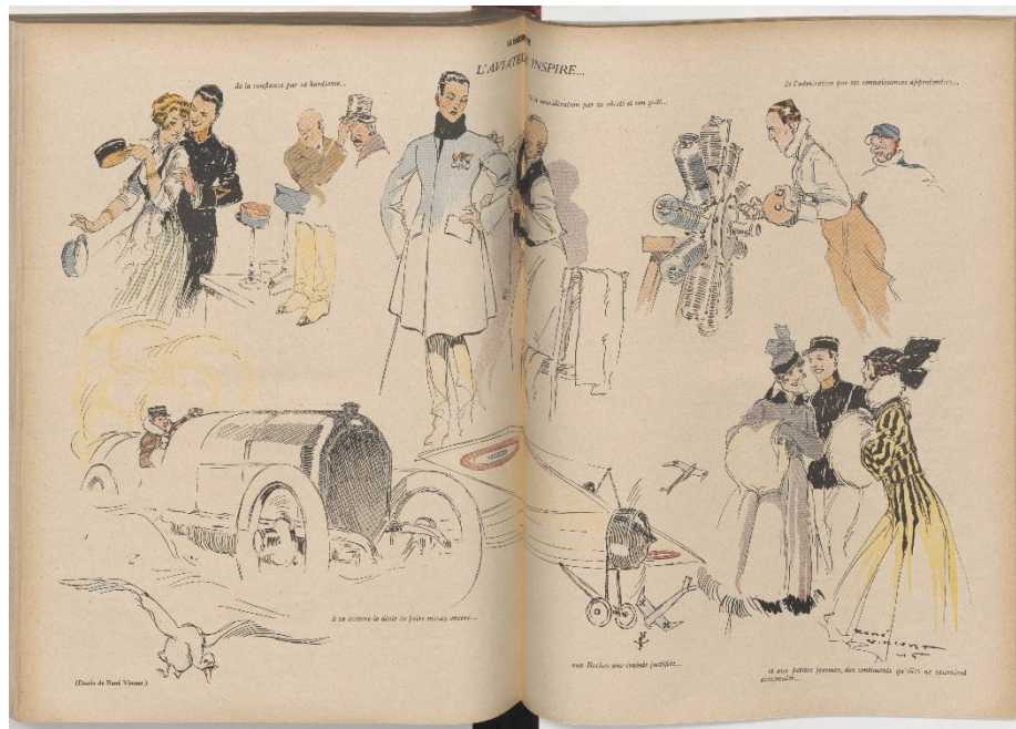
Fig. 5. The aviator portrayed by René Vincent in late 1915

R. Vincent, "L'Aviateur inspire...", La Baïonnette , 23 (16 December 1915), 376-377, https://gallica.bnf.fr/ark:/12148/bpt6k6580711t/f8