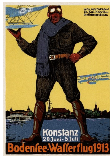
Fig. 1. Bodensee-Wasserflug 1913

“Bodensee-Wasserflug 1913”, reproduced in facsimile in Plakat gedanke und kunst (Stuttgart: Propaganda Stuttgart, 1912), 20, https://jstor.org/stable/10.2307/community.29391751 .