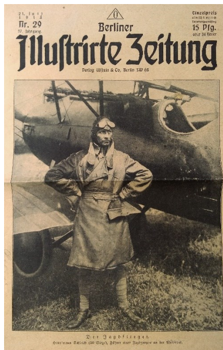
Fig. 2. Eduard Schleich

Bayerisches Hauptstaatsarchiv, Kriegsarchiv, Munich, MMJO V K 18/12, Berliner Illustrierte Zeitung , 21 July 1918.