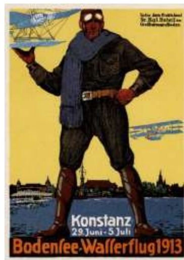
Fig. 1. Bodensee-Wasserflug 1913

“Bodensee-Wasserflug 1913”, reproduced in facsimile in Plakat gedanke und kunst (Stuttgart: Propaganda Stuttgart, 1912), 20, https://jstor.org/stable/10.2307/community.29391751 .