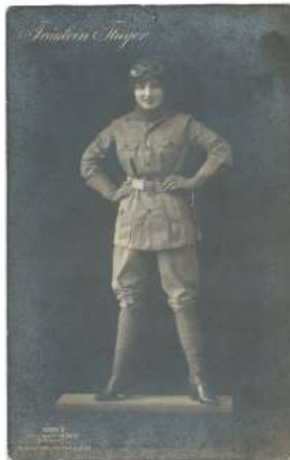
Fig. 3. German Postcard "Fräulein Flieger"

Personal collection of the author, Postkartenvertrieb Willi Sanke, "Fräulein Flieger", 5000/3, Berlin, ca.1918.