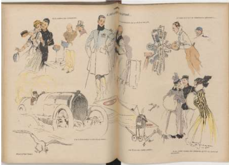
Fig. 5. The aviator portrayed by René Vincent in late 1915

R. Vincent, "L'Aviateur inspire...", La Baïonnette , 23 (16 December 1915), 376-377, https://gallica.bnf.fr/ark:/12148/bpt6k6580711t/f8