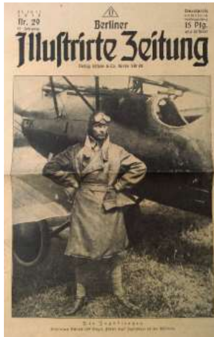
Fig. 2. Eduard Schleich

Bayerisches Hauptstaatsarchiv, Kriegsarchiv, Munich, MMJO V K 18/12, Berliner Illustrierte Zeitung , 21 July 1918.