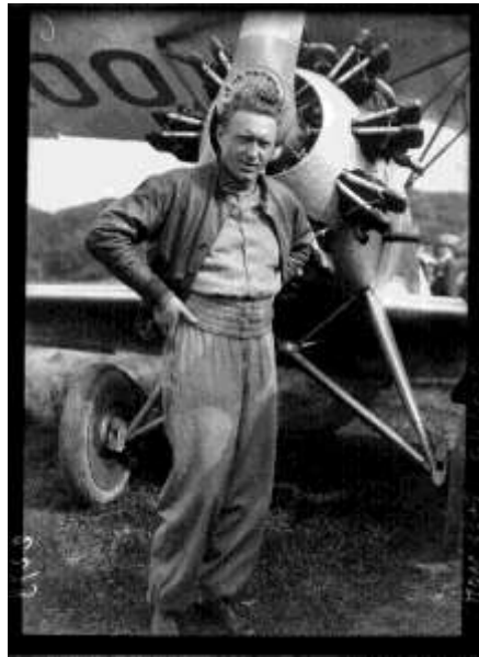
Fig. 4. Gerhard Fieseler

Bibliothèque nationale de France, Mondial, 2279, The German Fieseler, 4 June 1932, http://catalogue.bnf.fr/ark:/12148/cb41599162b .