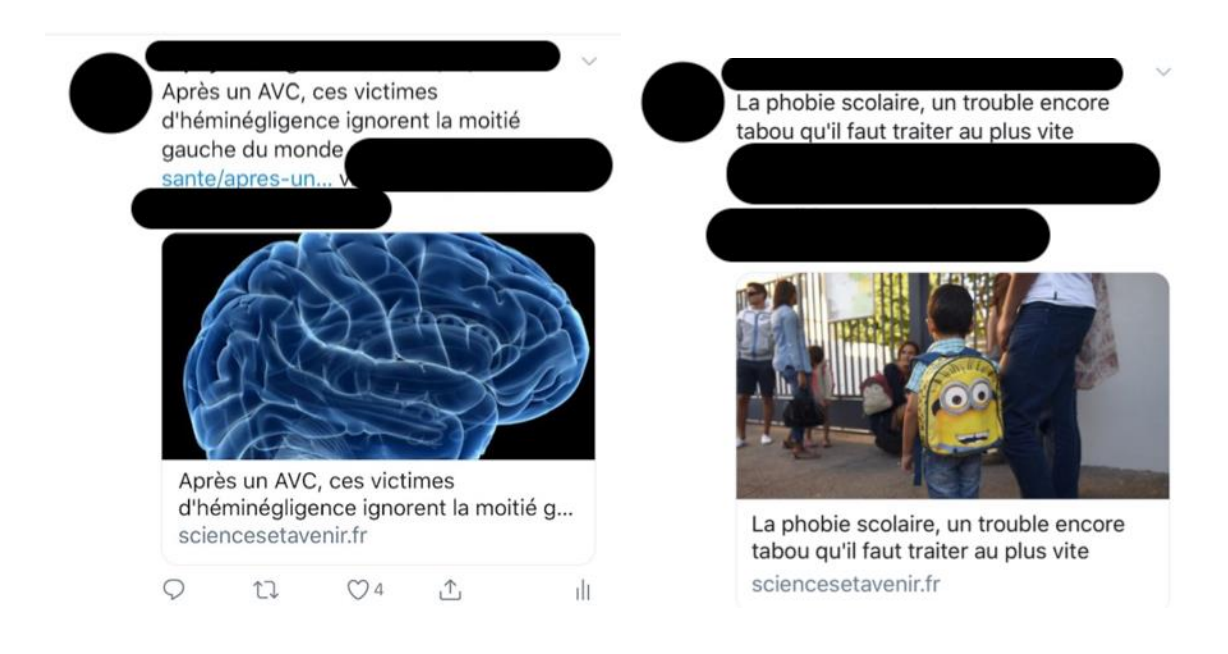
Figure 1. Multiple examples of tweets with course-related contents (partly blinded).