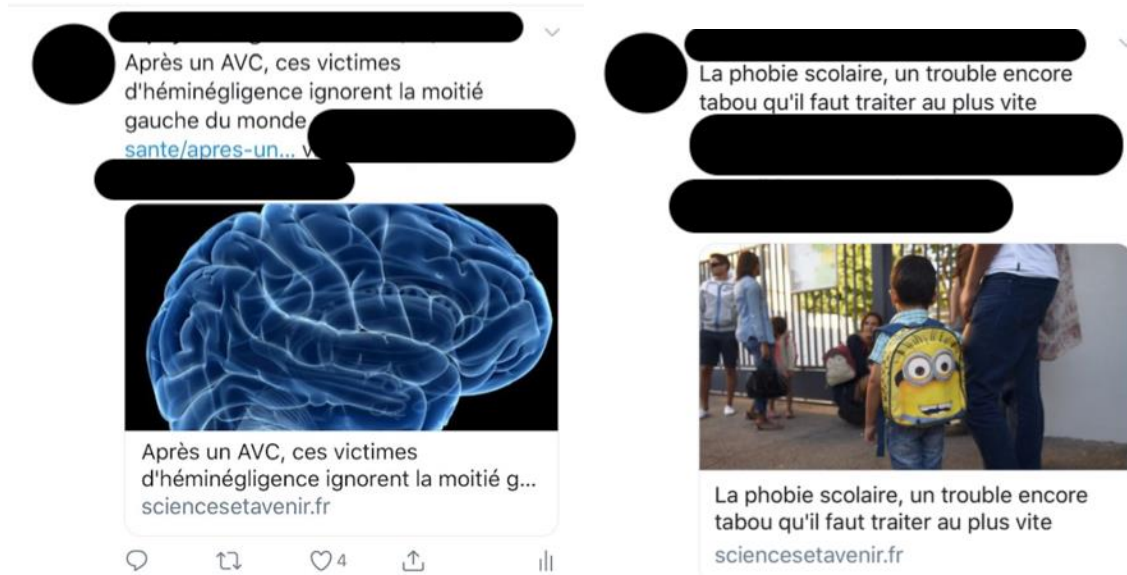
Figure 1. Multiple examples of tweets with course-related contents (partly blinded).