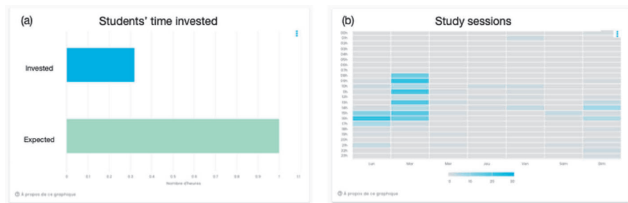
Fig. 2. Teachers' view. Visualizations offered for supporting time management. (a) Time invested by the students in the course (blue) vs. the time expected by the teacher (green). (c) Study sessions in a week. The dark squares represent the timeslots with the highest number of sessions. (Color figure online)

Phase (indicators #1 to 18 in Table 1). Second, NMP includes different visualizations to represent the indicators in Table 1. For example, teachers can see indicators about how much time in average students spend in the course per week compared with what they planned (Fig. 2(a)), when students connected for a learning session (Fig. 2(b)) and the number of study sessions organized by length in minutes (less than 30; more than 30 and less than 60; and more than 60). These visualizations were defined taking into consideration the results of the Design phase, in which experts proposed using hit maps for representing students' sessions and bars to compare the time invested compared with the time expected. Teachers can also access to the same information about a particular student. The same information is provided in the students' view, but personalized for each student. In this case, students could see the indicators and visualizations showing their time management indicators as well as the average indicators of the course as a reference point.