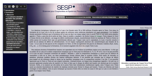
Figure 1: home page of the site SESP [3]

for the study of the object. Test : self-assessment exercises, to check that the chapters are understood and known. - Mini-project : a data analysis project with scientific data about solar system planets or exoplanets.