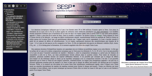
Figure 1: home page of the site SESP [3]

for the study of the object. Test : self-assessment exercises, to check that the chapters are understood and known. - Mini-project : a data analysis project with scientific data about solar system planets or exoplanets.