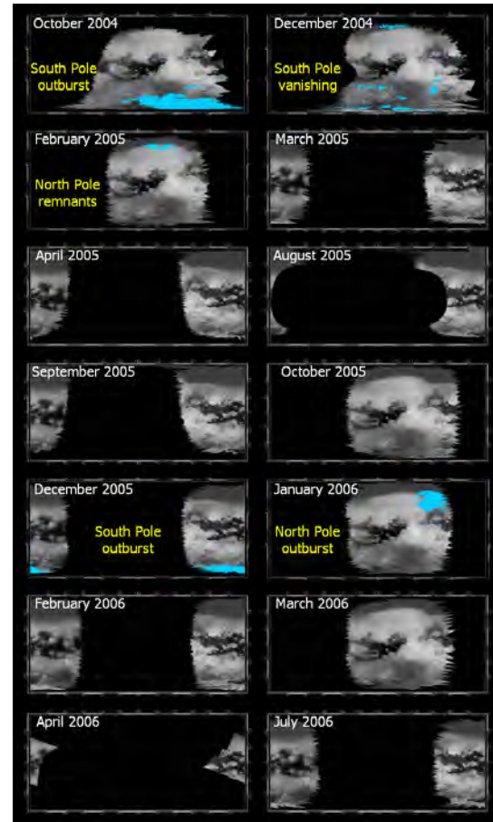
Figure 3. Occurrence maps of clouds (in blue) in Titan's atmosphere as derived from VIMS observations for each Cassini close flyby between October 2004 and July 2006.

Clouds distribution for a two years period: 14 clouds maps, one for each close flyby from October 2004 until July 2006, are presented in Figure 3 . These maps allow us to identify the individual clouds systems present in the hemisphere imaged by VIMS during each flyby and accurately follow their motion and persistence with time. The large clouds outburst at Titan's south pole, present in October 2004, vanish for almost one year and reappear in December 2005. The same behaviour is observed for the north polar clouds with a one month shift. With a maximum duration of one month, the 2005 south polar outburst was way more transient than previous southern events (seen by Cassini and ground-based telescopes in 2004, and only followed by ground-based telescopes before) that were lasting for at least 6 months for the shortest. Transient middle latitudes cloud events are also visible in both hemispheres and seem to develop thick clouds system at preferential longitudes (every 90^\circ starting from the center of the anti-Saturn hemisphere), but with a periodicity still hard to accurately determine. These clouds may have an orographic origin in addition to the global circulation forcing, and may hint for local reliefs and the presence of surface features releasing methane from the interior, such as cryovolcanos.