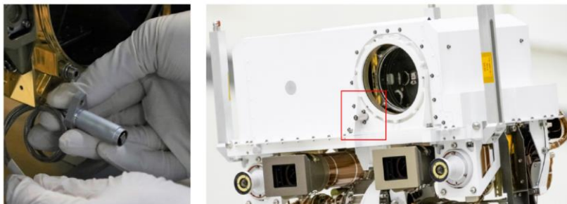
Figure 1 – The SuperCam microphone integrated on the top of the Remote Sensing Mast of Perseverance

Pre-Launch Performance: The microphone performance has been validated on engineering models in Mars conditions (6 mbar, CO 2 atmosphere and ablation capabilities similar to SuperCam) during tests in the Aarhus Wind Tunnel [5]. It showed that LIBS acoustic signals can be retrieved with a signal-to-noise higher than 10 dB for targets ablated at 4 m from the instrument even under a wind of 4.5 m/s. Characterization of the flight-model during Perseverance 's system thermal tests conducted under 10 mbar of N 2 highlighted a good synchronization and a signal-to-noise ratio higher than 16 dB for LIBS shots performed on the titanium and the ferrosilite calibration targets.