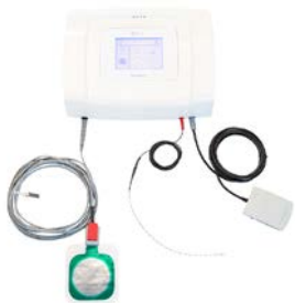
Figure 2: Radiofrequency treatment procedure