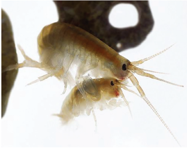
Fig. 1 Parhyale hawaiiensis couple. The male clasps the smaller female.

(pleon) units with conserved numbers of segments. The head bears sensory antennae and feeding appendages. The pereon is composed of eight segments: a first segment bearing modified feeding appendages (maxillipeds, T1), followed by two grasping appendages (gnathopods, T2–3) and five walking legs (T4–8). Maxillipeds are morphologically and functionally associated with the head segments. Walking legs T4–5 are oriented anteriorly, while T6–8 are oriented posteriorly—hence the name “amphipoda,” which derives from the Greek αμφί /both and πούς /leg. The pleon is composed of six segments, each with a pair of branched (biramous) appendages. The first three pairs are swimmerets, the following three are smaller and more stiff uropods for holding onto or jumping from the substrate. All these various appendages with different morphologies are considered to be serially homologous (Liubicich et al., 2009; Martin et al., 2016; Pavlopoulos et al., 2009; Pavlopoulos & Wolff, 2020). Divakaran (1976) provides a detailed description of the morphology, organ systems and biology of Parhyale hawaiiensis .