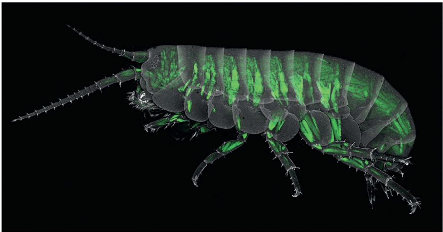
Fig. 4 Transgenic Parhyale juvenile expressing EGFP in muscles under the PhMS promoter. Confocal image of EGFP fluorescence (green) and cuticle autofluorescence (white).

So far, four robust endogenous CREs have been identified in Parhyale , two from hsp70 family genes and two from opsins. The first to be identified, PhMS ( MS for muscle-specific), is a fragment cloned from a Parhyale hsp70c ( hsp70 -related) gene, which drives robust expression in muscles (Pavlopoulos & Averof, 2005, sequence accession FR749990) (Fig. 4). It includes upstream regions that contain an array of putative bHLH binding sites, the promoter and a 5' UTR with an intron (see Fig. S1 in Kontarakis et al., 2011). PhMS has been used to visualize muscle fibres and satellite-like muscle precursors in the context of leg regeneration (Konstantinides & Averof, 2014). The second, PhHS ( HS for heat shock), is a heat inducible CRE cloned from a Parhyale hsp70 gene (Pavlopoulos et al., 2009, sequence accession FM991730). The fragment includes upstream sequences with putative HSF binding sites, the promoter and a 5' UTR with an intron (Fig. S1 in Kontarakis et al., 2011). PhHS is routinely used to drive