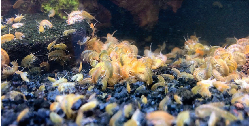
Fig. 3 A dense laboratory culture of Parhyale feeding on shrimp meal wafers.