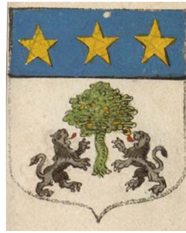
Fig. 6.2: Coat of arms of Jean Gaspard de Catala, from C. d'Hozier, Armorial général de France dressé en vertu de l'édit de 1696 , vol. 15 (Languedoc II) (Bibliothèque nationale de France, Département des Manuscrits. Français 32242, p. 1225).

The proto-heraldry used by so many rural notables is expressive of the prestige of heraldry among the population. Inserting initials and a date into a shield was deemed an appropriate way to suggest a level of notability that the same inscriptions alone would not convey. But when the social standing of one individual is enhanced, the adoption of a proper coat of arms becomes a necessary step to assert that advancement among the community. Compliance with the rules of blazon is itself a social marker, as a sign of good education as taught in higher schools.