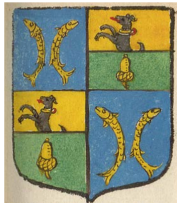
Fig. 6.4: Coat of arms of Léopold Gaspard Barbaud de Suarce, from C. d'Hozier, Armorial général de France dressé en vertu de l'édit de 1696 , vol. 7 (Bourgogne comté) (Bibliothèque nationale de France, Département des Manuscrits. Français 32234, p. 375).

Some coats of arms include different levels of 'similarisation' up to the point of imitation of the arms of a specific family. In 1675, the ironmaster Gaspard Barbaud, established in southern Alsace, was raised to the nobility by Louis XIV. 42 His grandson, Léopold Gaspard Barbaud de Suarce, used a quartered shield that illustrates the variety of iconographic strategies a family could use to promote itself (fig. 6.4). Quartered shields are ordinarily used to display advantageous matrimonial alliances, but in this case the prestige of quartering is fictitious, since all the quarters refer to a single family. While any allusion to industry is concealed, each pair of quarters cants on the family name using charges with noble implications. In the second and third quarters appears a 'barbet', a dog used in the noble activity of hunting, surmounting an acorn, fruit of the king of trees. In the first and fourth quarters are two 'barbauds', a species of fish, in conscious imitation of the arms of an old and powerful local feudal family, the counts of Ferrette, which had the same arms except for the colour of the field.