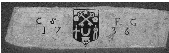
Fig. 6.5: Coat of arms of Claude Soulier, smith in the village of Liesle (Doubs, France), 1736.

well who was who. Thus, this blacksmith is most certainly addressing the village community and his fellow smiths. The fact that his shield encompasses not only the expected tools used by a smith (e.g., anvil, pincers) but also crossed keys displayed in a heraldic style presents him as a qualified craftsman able to make elaborate ironwork such as gates and locks. This is confirmed by parish registers, which mention him not only as a ‘locksmith’, but also as a ‘master blacksmith’. By adopting this coat of arms Claude Soulier presented himself as something of a smith d’élite .