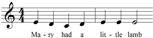
Fig. 1: Musical score of “Mary had a little lamb” (dataset 1).

1) Data : The proposed technique for joint factorization of amplitude audio spectrograms is applied to two synthetic audio samples. A dedicated test procedure is presented in Section IV-A2 in order to evaluate the performance of MR- \beta -NMF based on quantitative criteria detailed in subsection IV-A3. The first audio sample is the first measure of “Mary had a little lamb” and composed of three notes; E_4 , D_4 and C_4 . The signal is 5 seconds long and has a sampling frequency f_s = 44100\text{Hz} yielding T = 220500 samples.