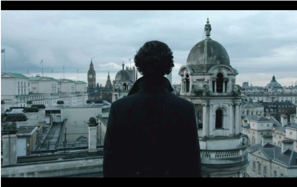
Fig. 2. Sherlock as a viewpoint, screenshot from Sherlock (2010-), season 3, episode 1 ("The Empty Hearse")