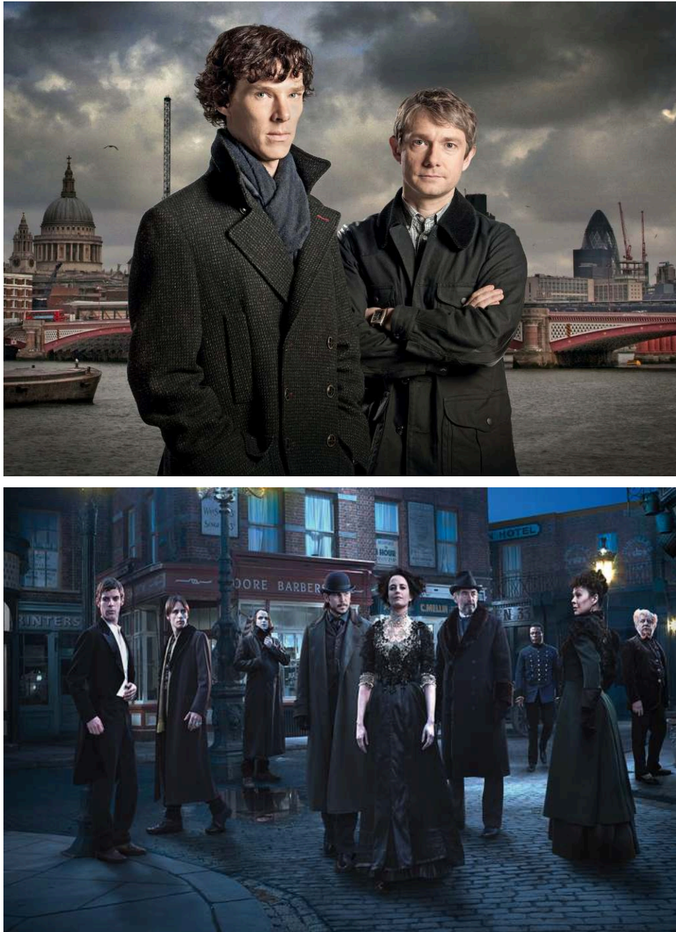
Fig. 4. Monumental London in Sherlock (season 1) vs horizontal, street-centred London in Penny Dreadful (season 1)