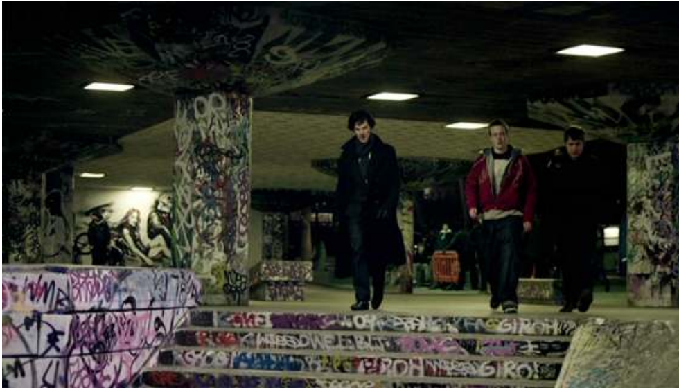
Fig. 3. South Bank: the London other/the other London, screenshot from Sherlock (2010-), season 1, episode 2 ("The Blind Banker")

conservative form of nostalgia aforementioned. To put it bluntly, otherness is fine as long as it is spatially limited and known by Sherlock, therefore unthreatening to the hero and to the image of England that needs to be conveyed globally.