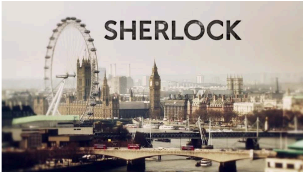
Fig. 1. Screenshot of a transitional shot in season 1 of Sherlock (2010-)