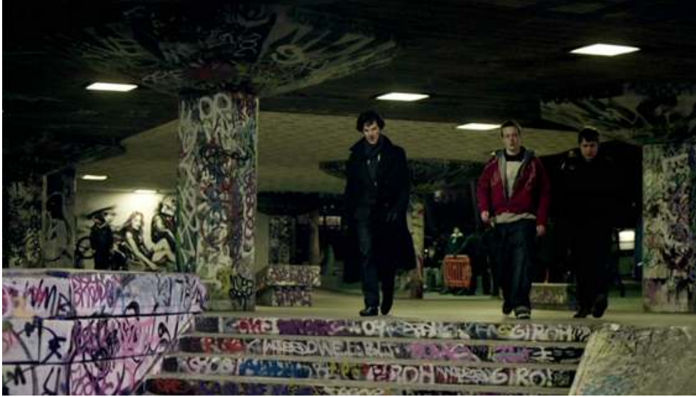
Fig. 3. South Bank: the London other/the other London, screenshot from Sherlock (2010-), season 1, episode 2 ("The Blind Banker")

conservative form of nostalgia aforementioned. To put it bluntly, otherness is fine as long as it is spatially limited and known by Sherlock, therefore unthreatening to the hero and to the image of England that needs to be conveyed globally.