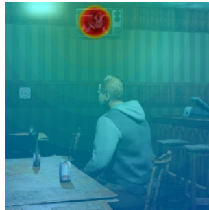
(b) The TV in the back of the bar is very attractive semantically, which is enforced using the attention map T_{att} .