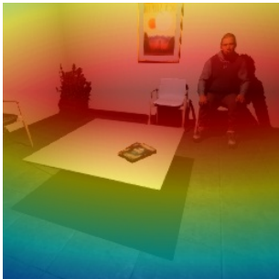
(a) The horizontal bias map T_{HB} increases the probability to look at the horizon instead of the ground.