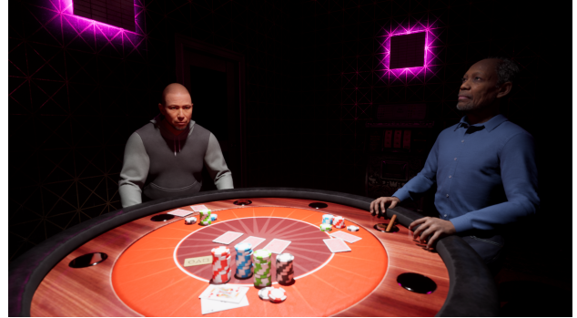
(d) Scene 3: The poker table.