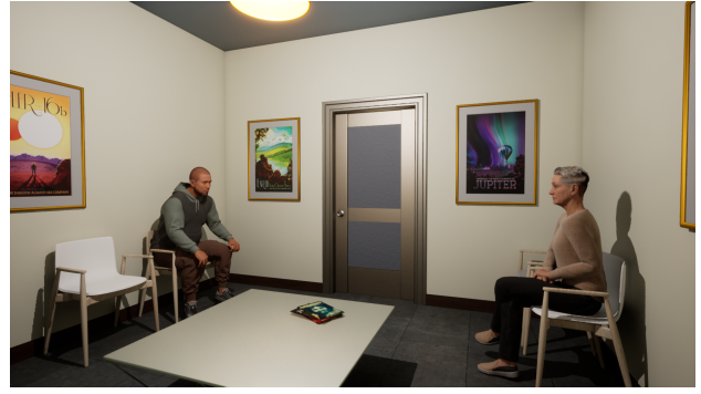
(b) Scene 1: The waiting room.