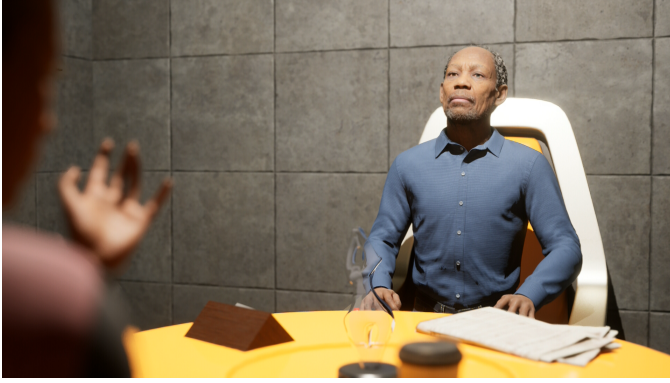
Fig. 4: Scene presented to participants in the subjective evaluation.

they do not take the environment into account (no influence of the saliency map).