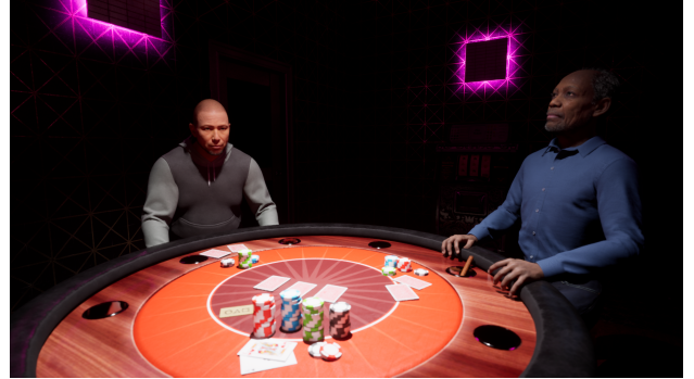
(d) Scene 3: The poker table.