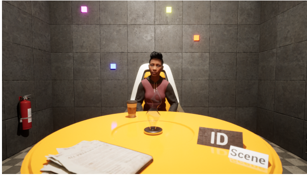
(a) The lobby.