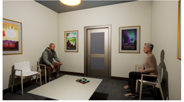
(b) Scene 1: The waiting room.