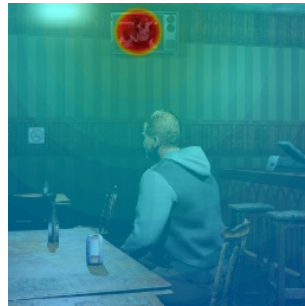
(b) The TV in the back of the bar is very attractive semantically, which is enforced using the attention map T_{att} .