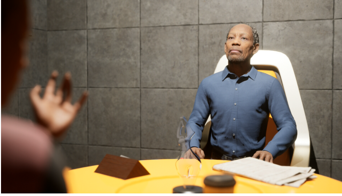
Fig. 4: Scene presented to participants in the subjective evaluation.

they do not take the environment into account (no influence of the saliency map).