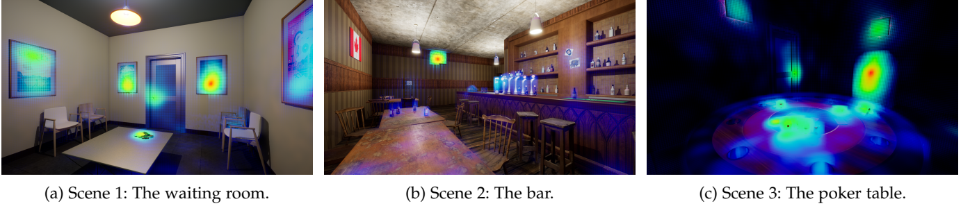
Fig. 3: Examples of our saliency maps on static scenes.

to 1: opened). We used raycasting along the gaze direction vector to record the exact 3D position of the point gazed at in the scene, as well as the unique ID of the corresponding object. Over all participants, we recorded a total of 1,469,643 gaze samples, which were then processed according to the following two steps.