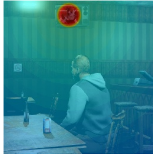
(b) The TV in the back of the bar is very attractive semantically, which is enforced using the attention map T_{att} .