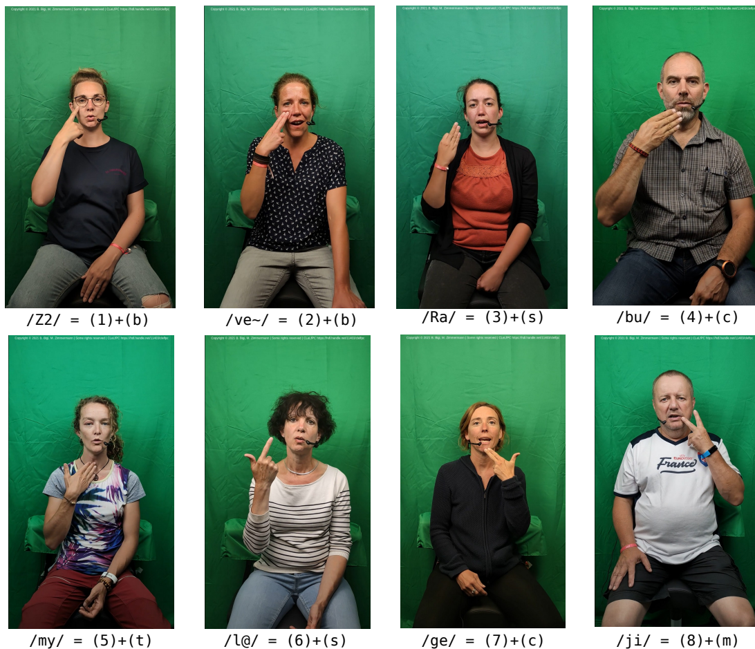
Figure 1: French CS keys represented with screenshots of CLeLFPC