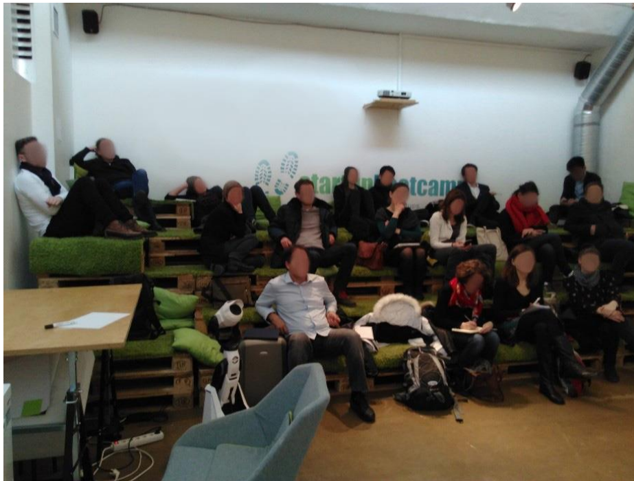
Figure 6. Agora time in a coworking space