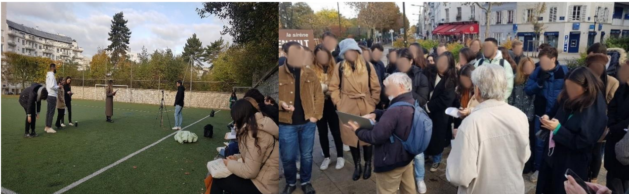
Figure 2. Moments in the opening session of OpenAca (November, 2021)

The first session was about "Preserving an industrial memory: the site of Boulogne-Billancourt" ("Préserver une mémoire industrielle: le site de Boulogne-Billancourt"). The idea was to "explore further the past of work, its presence in contemporary experience, how it is enacted, what can be learned from it, how its incompleteness and tensions have been and still can be generative for our present" (extract from notes). Students got in touch with an association of retired people from Renault (the French car maker had a major factory in Boulogne-Billancourt up until 1992). We started our course with some formal elements and a presentation of archives by the students (see Figure 2). Then, four retired Renault employees from (three former workers and one former executive manager) guided us in Boulogne-Billancourt to comment on the remaining vestiges of industry or invisibilities of the past around us. Overall, three PhD students joined us at this stage. Numerous people also started to follow us from a distance on social media. At this stage, we diffused as much content as we could for those attending the course remotely in time and space.