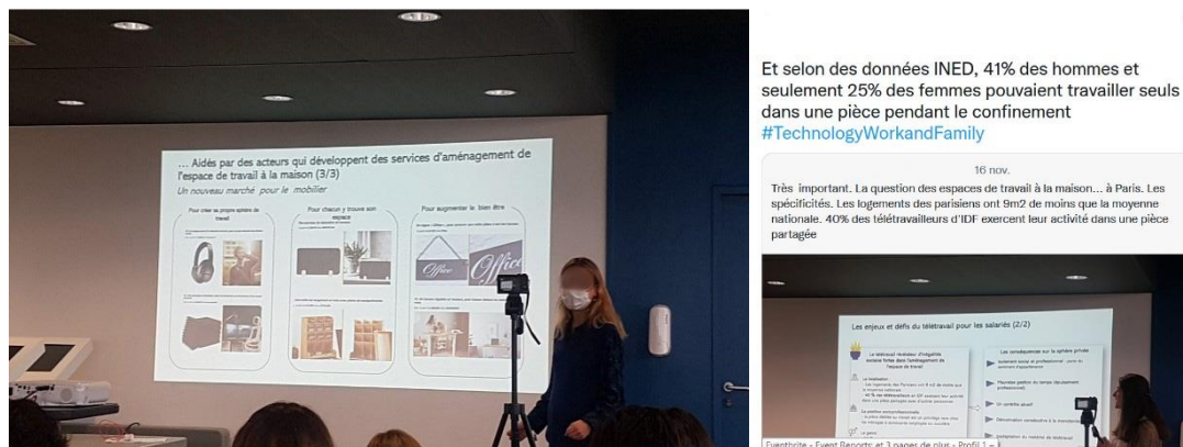
Figure 4. Capture and social media comments