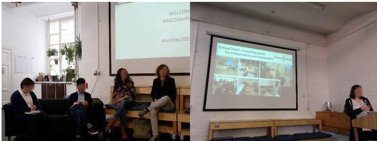
Figure 5. Opening moment at a coworking space in Berlin