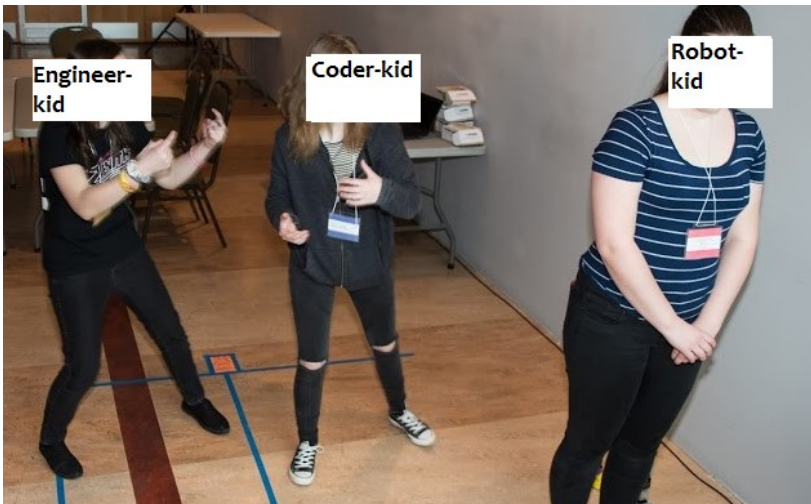
Figure 1. Secondary pupils playing the robot game