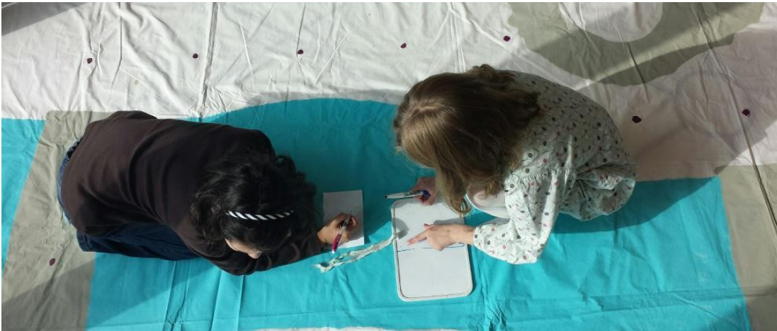
Figure 5. Designing programs for the robot.

To extend the learning objectives, bugs can be slipped into the programs. To begin with, pupils have to describe the program executed by the robot, then later on they have to correct the bugs in the program to achieve the objective. It is also interesting to translate a program from one language into another by switching from absolute movements to relative movements, and vice versa.