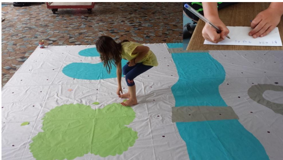
Figure 3. Robot game on a landscape created with a sheet.

In this environment, the places where the robot can and cannot walk are clearly explained, along with the commands it can execute. To begin with, absolute movements can be made by fixing the direction in which the pupil playing the robot is facing and making the pupil do translations but not rotations.