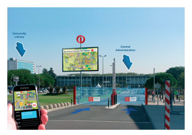
Figure 14.2. View of an ambient campus

between two advertisements. Neo accepts and without any effort on his part, the map is displayed. In addition, these screens are fitted with intuitive control interfaces and Neo can easily use this map for additional information, etc.