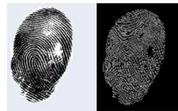
Fig. 2: Fingerprint image after applying the canny algorithm

In the Canny edge detection algorithm, firstly noise reduction is realized by using Gauss filter. Then, the sobel masks are applied to detect strong and weak edges, and the edge direction and gradient size of the pixels on the image are calculated. As a result of this edge detection algorithm, a binary image is obtained in which the white pixels are close to the real edges of the original image. The Canny operator creates continuity between adjacent pixels and creates a single pixel image. In Fig. 2 after applying the Canny algorithm of the fingerprint image, the edges of the image are determined.