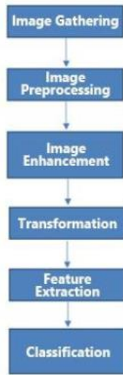
Fig. 1: Image processing stages

In the study, the objective is to classify the fingerprints without analyzing the natural properties of the fingerprints during the preprocess stage.. CNN method is selected for achieving this goal. Image preprocessing steps are not realized while using CNN method.