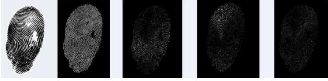
Fig. 3: Fingerprint transformation phase.

In the study, single level 2-D wavelet transform calculated and compression technique is used. Horizontal, vertical and diagonal matrices are calculated. The 2D wavelet transform